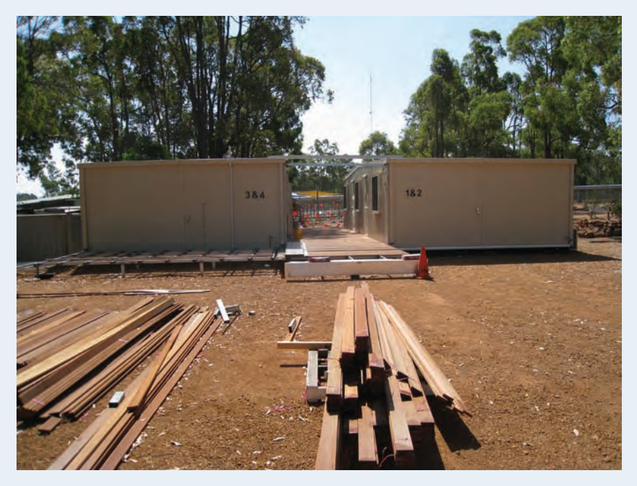
Two transportable units to be used as program rooms were being installed at the time of the inspection.