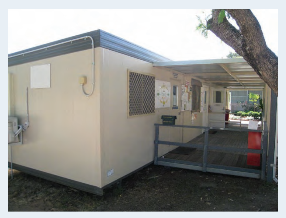
A transportable unit used as office space by staff including the Transitional Manager, Employment Coordinator and Community Corrections Officer.