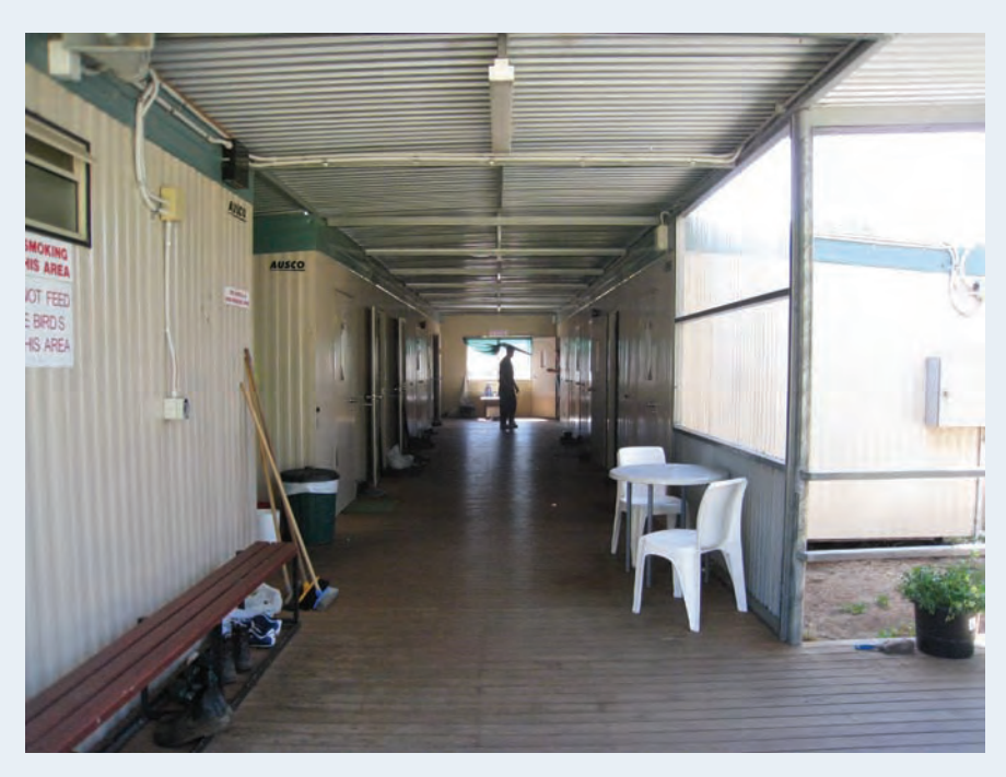
The extension to Unit 2 which was created with transportable units.