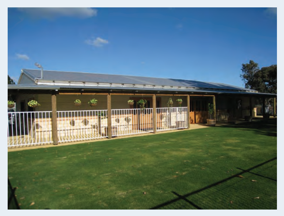
The new Shared Facilities Centre serves as the visitors' centre on the weekend and a staff training centre during the week. It is an impressive asset for the prison, and a significant achievement, having been built almost entirely by Karnet prisoners.