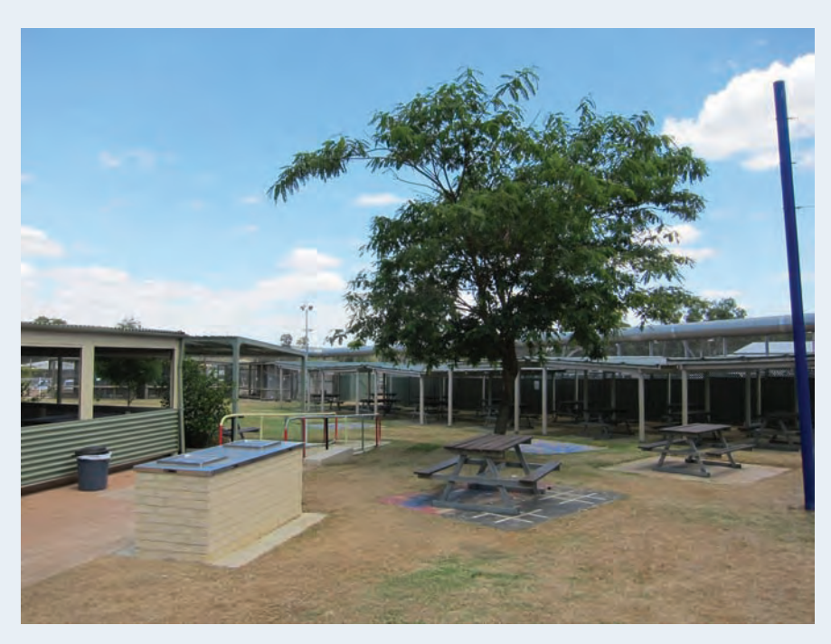
The visits centre provides a positive atmosphere for prisoners and their families during visit sessions.