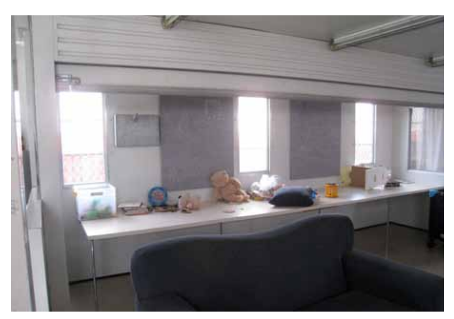
Interior of day stay demountable