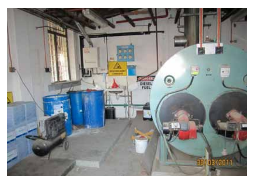
Disused boiler room used to store highly flammable and corrosive chemicals, despite the tanks containing diesel residue, and a smoke fire having occurred in the boiler room in early 2010 as a result of chemicals spontaneously combusting.