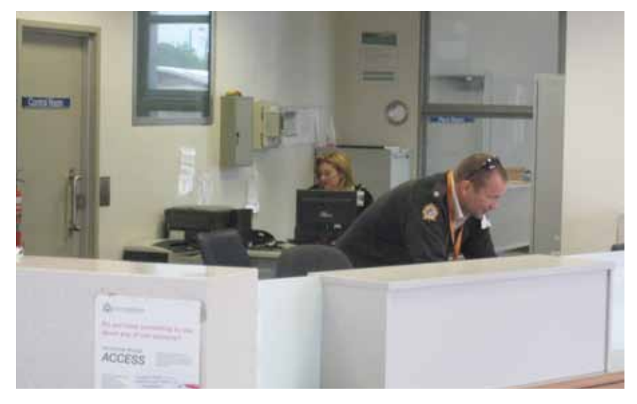
The front desk of the gatehouse.