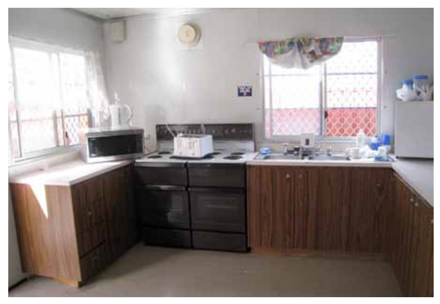
Interior of day stay demountable