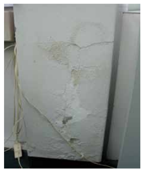
Mould on wall in ASPM's Office.

Ensure the safety system at Bandyup is known and used by all staff, and is effective in minimising risk, ensuring remedial follow-up, and identifying opportunities for prevention and improvement.