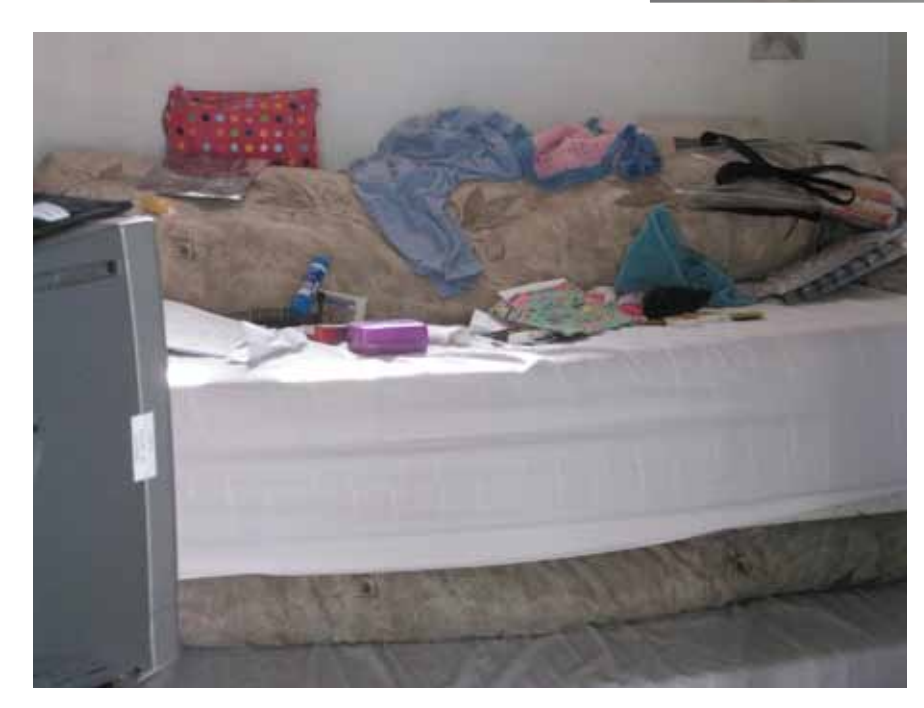
A Unit 1 single cell shared by two women. Note the mattress under the bed, which is pulled out at night for the second person to use.