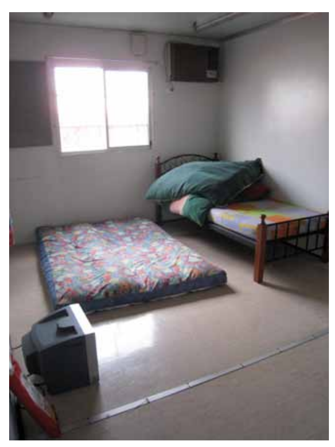
The bedroom in the day stay demountable