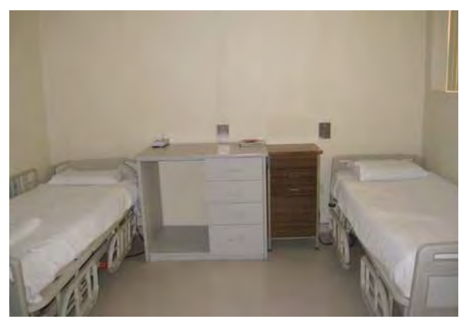
The 'Infirmary': note the dimension of the room prevents beds being safely positioned away from the walls