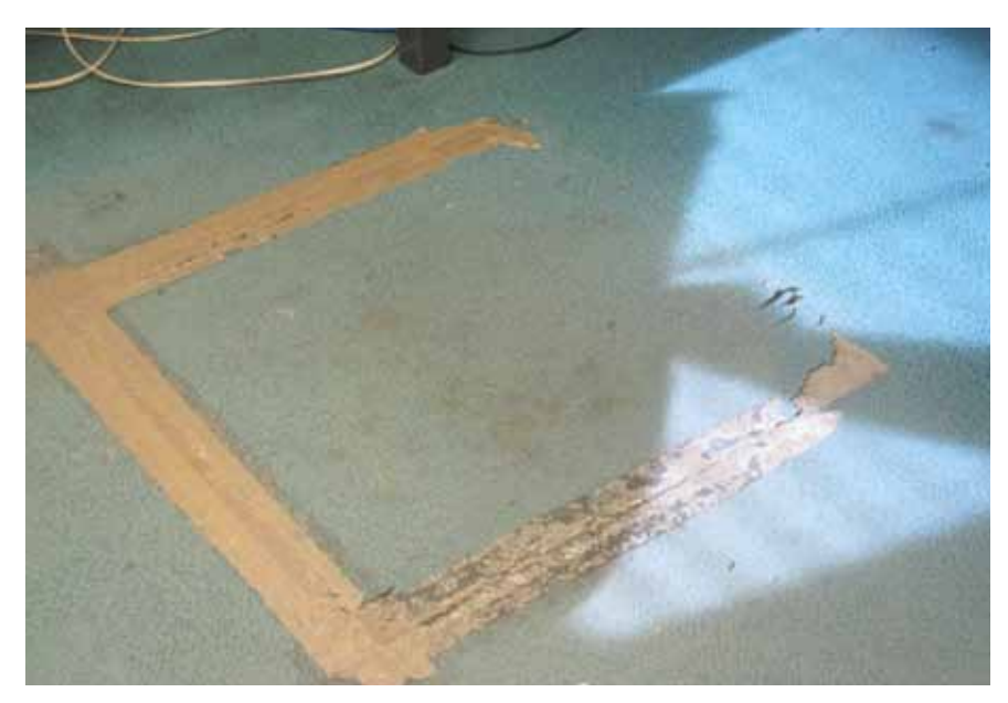
Carpet taped into place in Unit 1 pod.