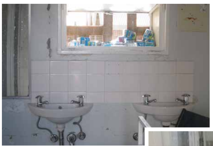
Unit 1 ablutions area