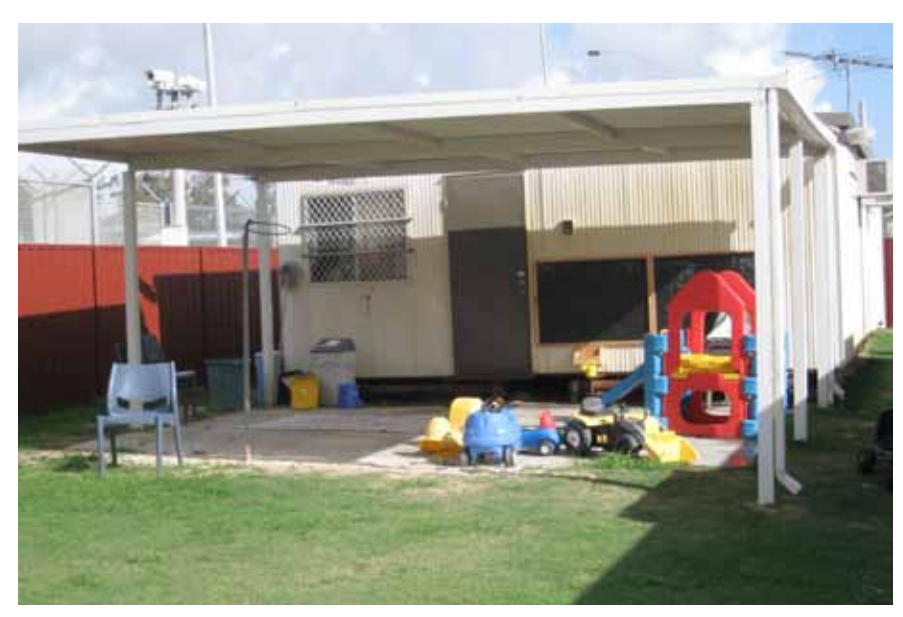
The day stay demountable