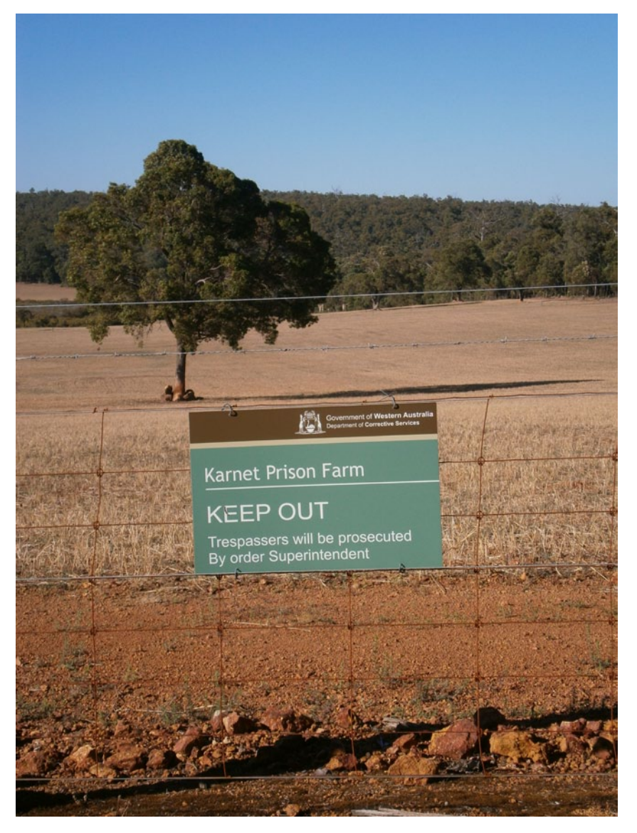
View across Karnet farm

1.23 The broad conclusion offered by the Inspector in the exit debrief was that Karnet was performing well, as it has done consistently over the past four rounds of reporting. Nonetheless, a number of key challenges were identified, and it is hoped that this report will provide the impetus to further push the boundaries of Karnet's achievements.