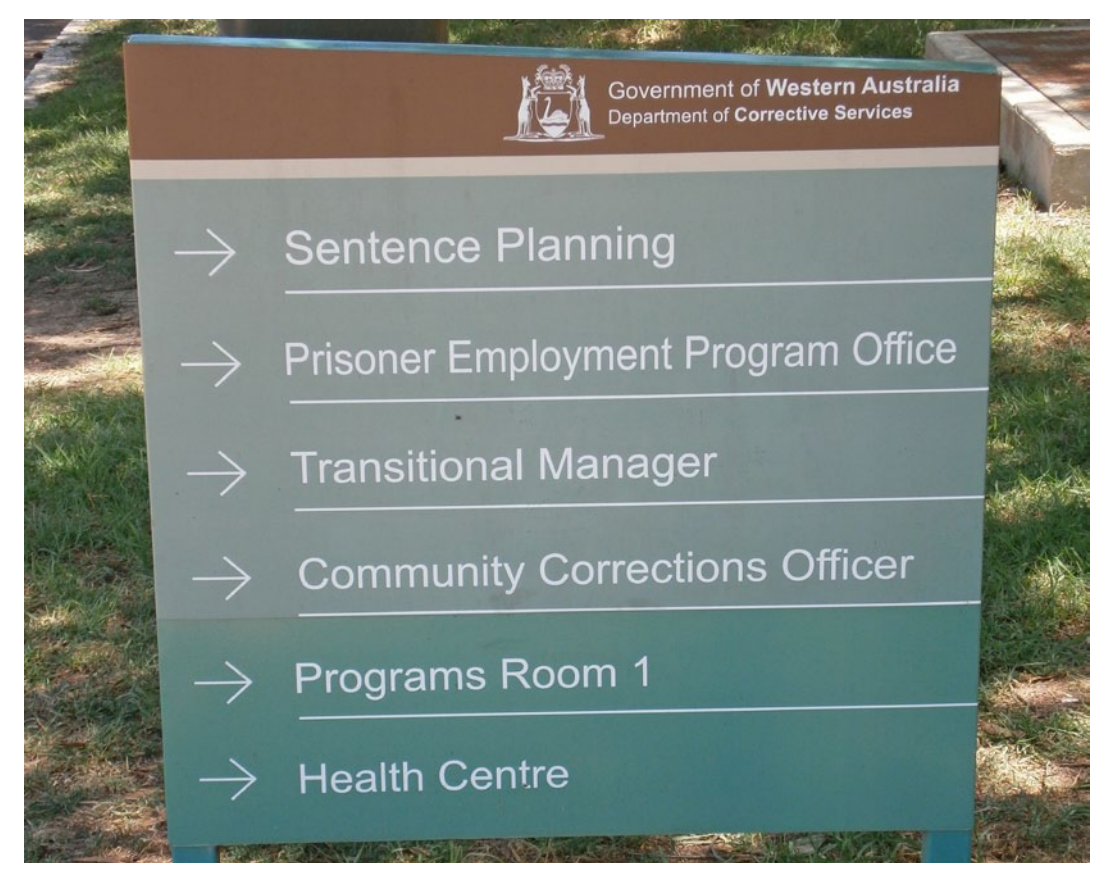
Karnet's 'one stop shop' re-entry services

4.5 Karnet's re-entry staff reported having positive working relationships with the external agencies engaged to provide a range of transitional support services. This was evidenced by a well-attended and organised Inside Out Expo which took place at the Prison during the Inspection. The Expo featured numerous stalls from a variety of community groups and services, covering areas such as health, mental health, accommodation, employment, and financial assistance.