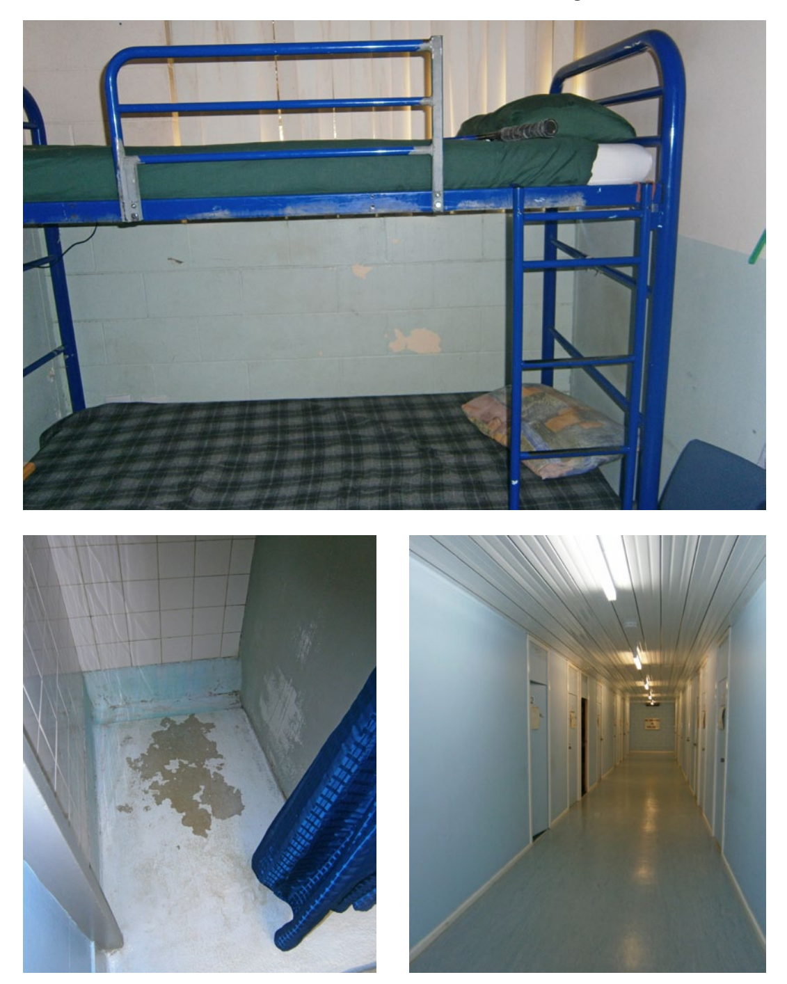
Unit 2: new flooring in the hallways compared to the interior of a cell and shared bathroom facility.

2.25 The 2013 inspection found that while a great deal of external work had been done to many of the buildings at Karnet, their interiors and particularly cell interiors showed little improvement. One exception was the recently replaced vinyl flooring in the hallways of the original accommodation wings of Unit 2. In contrast however, the interiors of the cells and shared bathroom facilities in both Units 1 and 2 were dilapidated.