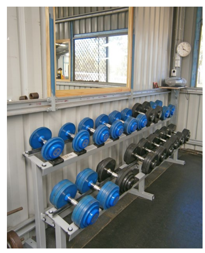
Recreation options in Karnet's gymnasium