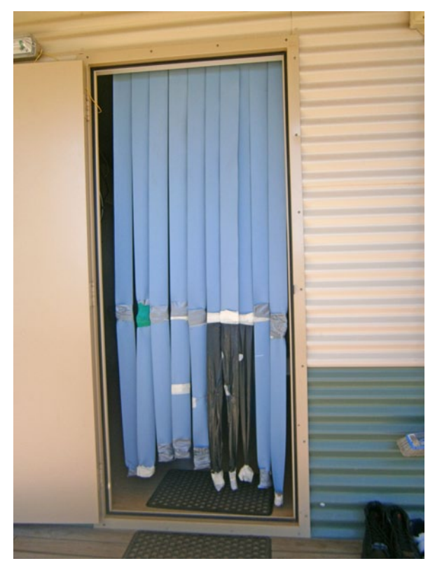
An example of a prisoner-made flyscreen