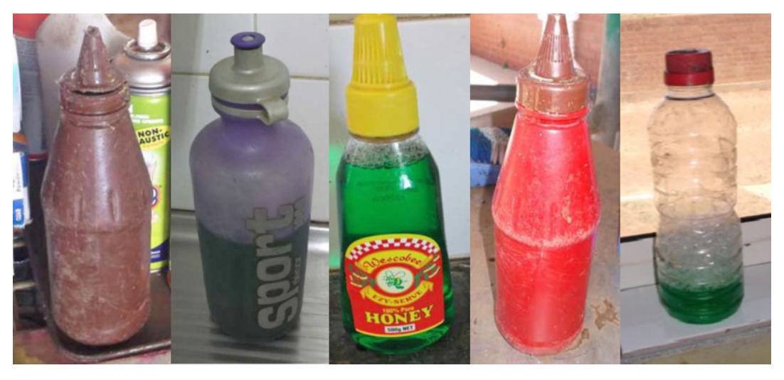
Liquid chemicals stored in food and drink containers

Recommendation 18: Ensure that all chemicals are accurately labelled and stored appropriately.