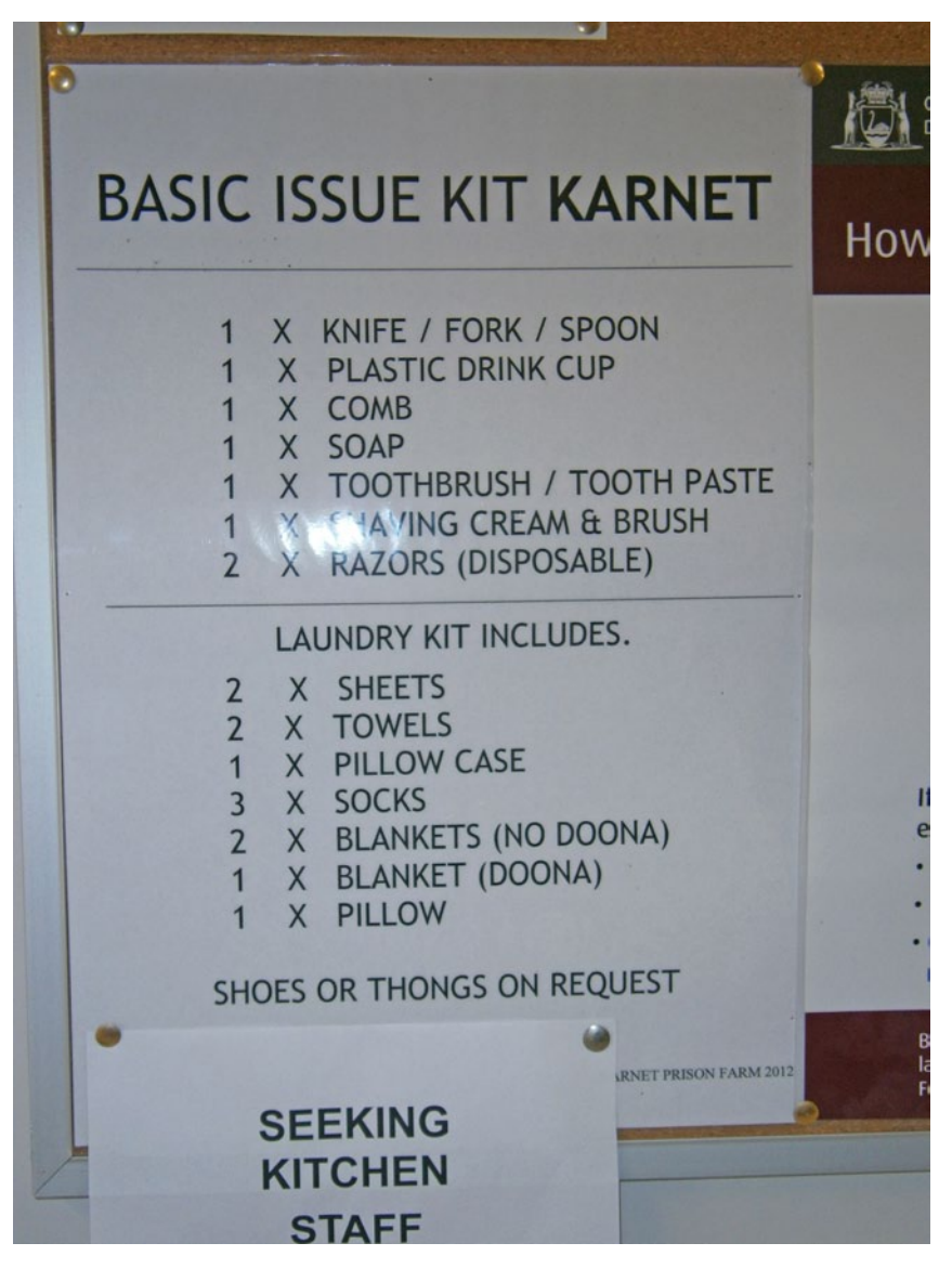
Information posted in Karnet's new Reception building

3.6 Since the last Karnet inspection in 2010, a new purpose built reception facility has been completed, with a vastly improved capacity to store, record and manage the personal property belonging to prisoners. This facility was found to be effective, user-friendly and supported by a computerised system of record keeping. Such measures represent an enormous improvement on storage methods previously used, which were unacceptably cramped and incapable of housing prisoner property.