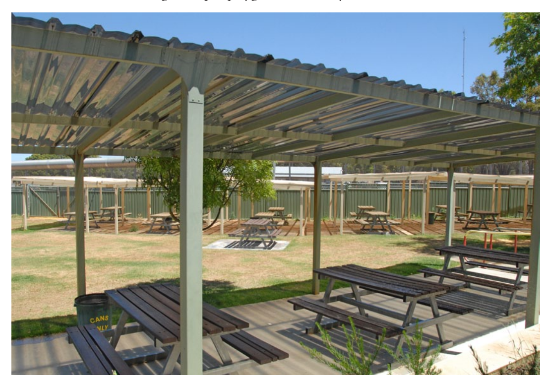
View of the outdoor visits area

3.9 The visitor's centre at Karnet has previously been praised by this Office as one of the most pleasant, spacious and family-friendly visiting environments of any custodial facility in Western Australia.<sup>57</sup> The indoor visits area is spacious and informal, and the connecting outdoor area includes an undercover area, lawns, and is bordered by aviaries. Children are well catered for with a large sandpit, playground, and toy collection available.