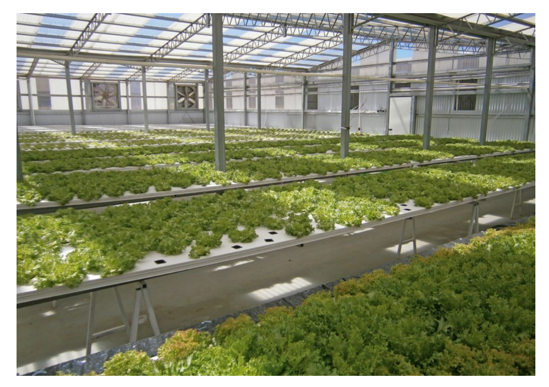
One of Karnet's many employment and training opportunities

4.31 Karnet is truly a working prison, unlike some other prisons which claim full employment by stacking units with underemployed unit workers. The prison provides a wide range of employment, education and training opportunities. Traditional prison industries are complemented by agricultural workshops and industries, an abattoir, horticulture, animal husbandry, construction and maintenance, and a sign making and print workshop.