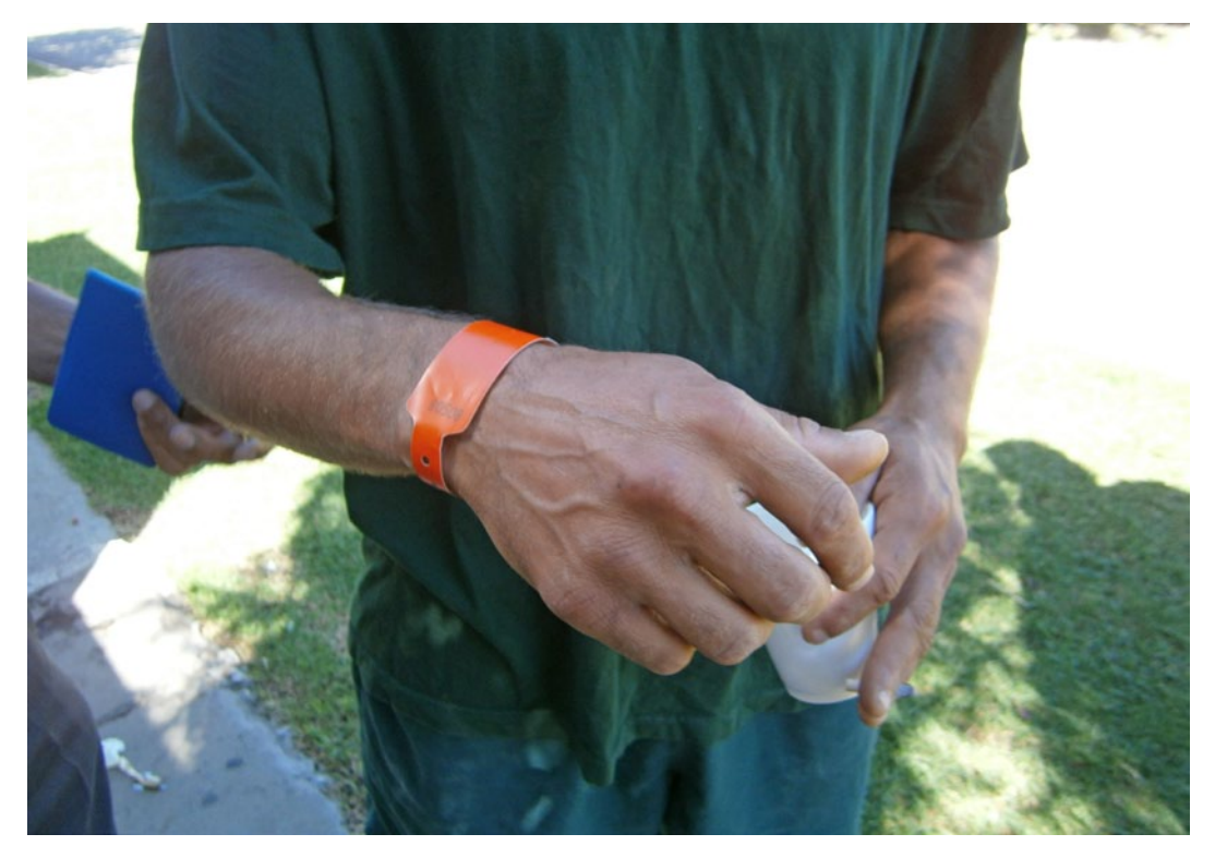
A wristband identifying placement in the Drug Management Unit

2.19 There are many positive elements to this regime, most significantly in affording prisoners the chance to change their behaviour without immediate risk to their position at Karnet. However, in order for the regime to be effective, prison officers must be able to easily identify which prisoners are subject to the regime at any given time, and this has caused some debate. At the time of the inspection, prisoners being housed in the DMU were required to wear brightly coloured wristbands.<sup>32</sup> A number of prisoners reported that they found this to be shameful and humiliating, while some staff commented that it made identifying those with drug connections in the prison that much easier for other prisoners.