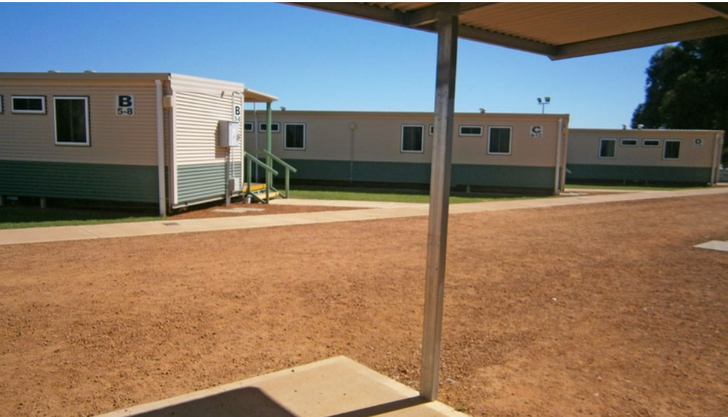
The front view of a Unit 4 accommodation block, showing the verandah where prisoners congregate, and the rear view of the blocks from the front of the unit office.