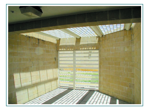
The exercise yard.