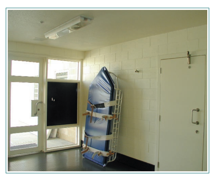
The "blue bed".