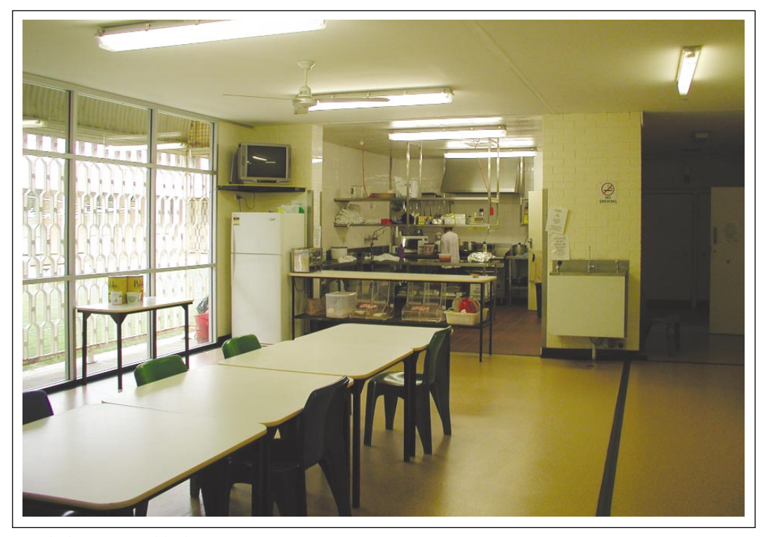
Female dining area and kitchen.

3.7 At the time of the Inspection most of the small group of women prisoners at Greenough were accommodated in the women's self-care part of Unit 5. A small number of women were accommodated outside the self-care section of Unit 5 in cells that, by virtue of an adjustable grille arrangement, can be considered as part either of Unit 3 or Unit 5. Since the official closure of Unit 3 these cells are considered part of Unit 5, despite the lesser amenity of the accommodation. It served during the period of high numbers as an incentive in a hierarchical approach to prisoner management. The current numbers of female prisoners call this particular hierarchical arrangement into question. There are better ways to include incentives in the management of small numbers of women prisoners, and the exclusion of two or three women from the life and activity of Unit 5 self-care should be discontinued.