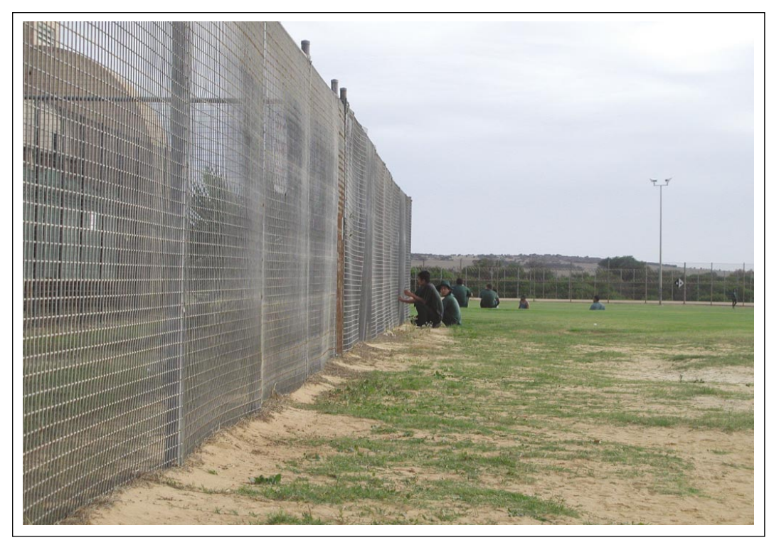
Prisoner talking through the fence.

opportunity for visual contact so approvals, processes and procedures are all important. The prison's hard line on male/female contact is reflected in the procedures and processes for these visits. Even those whose relationships have been officially recognised within the Department and approved for the purposes of visits must re-apply each time a visit is sought – each week for those wishing to optimise the number of such visits they participate in. <sup>55</sup> When a prisoner from elsewhere is on temporary transfer status to Greenough Prison to see an imprisoned partner, she or he is subjected to rigid visit arrangements. During intra-prison visits prisoners must stay in the indoor part of the visits centre and sit at a table opposite, rather than next to, each other. In these arrangements there is little opportunity for private conversation. Female and male prisoners involved in intra-prison visits are randomly strip-searched after the visit, before returning to the units. Since neither party comes from outside the prison this seems excessive.