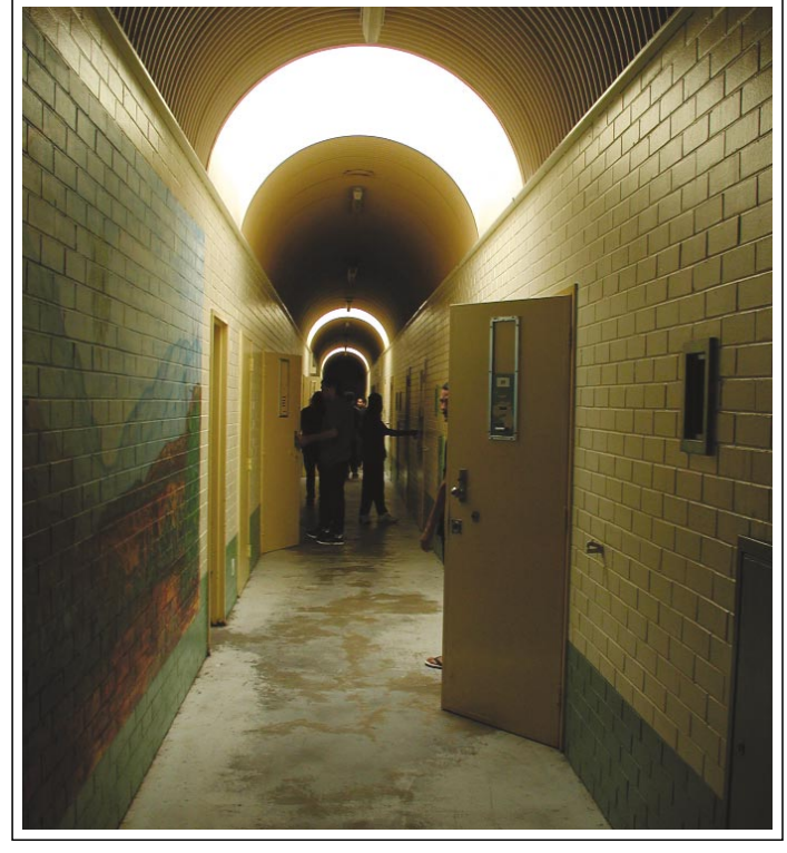
Corridor in Unit 1.

with the situation at the prison in December 1998 when the daily average population was in the 170–180 range, that by January had increased to 180-190 and by March 1999 had averaged at just over 220 and eventually peaked at 259. The average population count for the year 2002 was 173 or 82 per cent of the prison's design capacity. This margin is essential to good operational practice because it provides for separation of sub-population categories and enables staff to properly focus on the relevant regimes of each group.