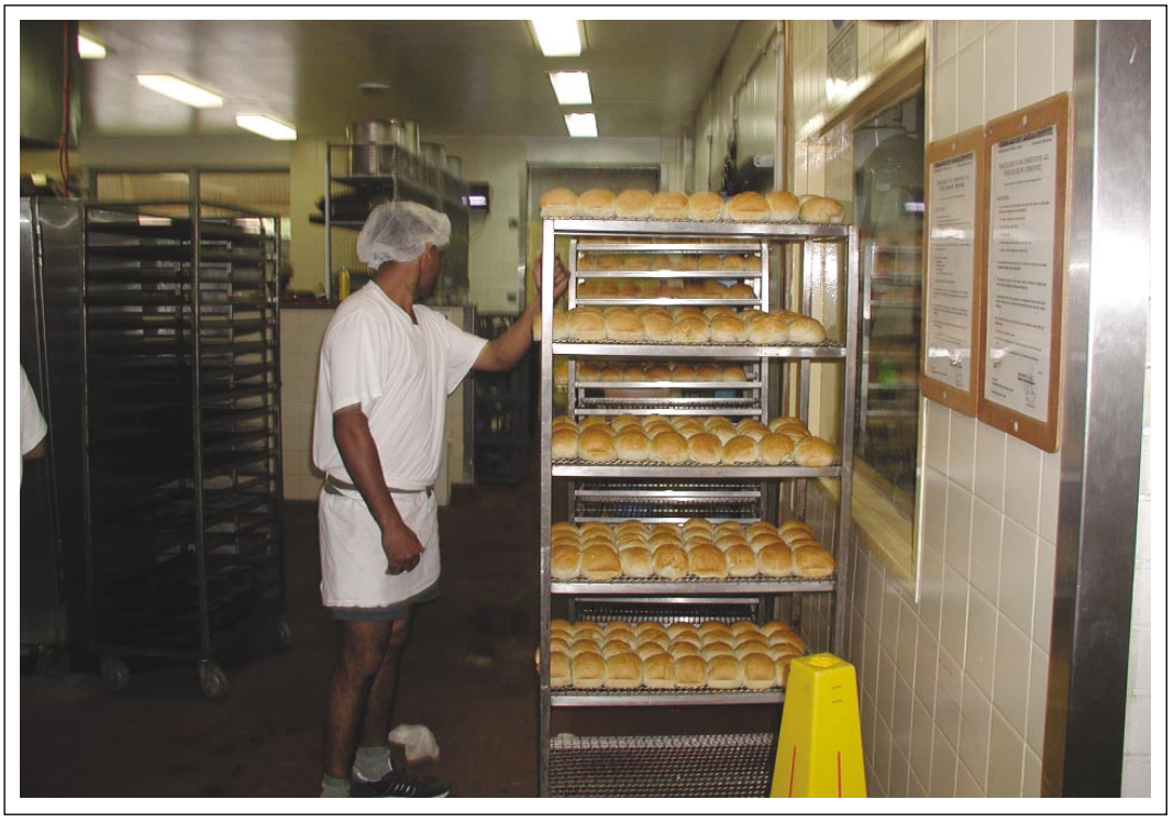
View of the kitchen.

contract requirements and also works in conjunction with the women's textile shop and education services to produce innovative and high-quality products. As well as producing craypot components pursuant to two separate contracts, the metals workshop has produced other products such as tables and stoves that are sold by the prison. The value of production from the metal shop is currently $30,000, but this is likely to increase with additional contracts being explored. There is a training course available in engineering production (Certificate 1 Engineering) that serves to enhance the attraction of working in the metal shop, as it is a valued qualification in the community.