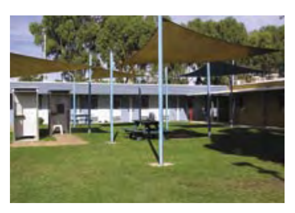
The communal outdoor area of Unit 1, one of the oldest units in the prison.