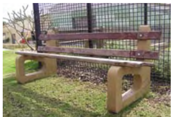
Before: A bench before it was brightened up.