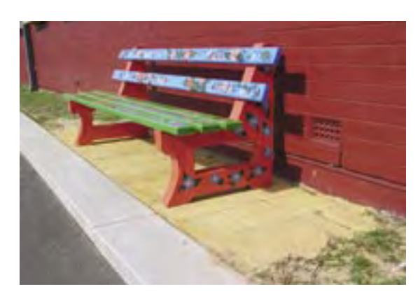
After: Prisoners have decorated these benches all around the prison.