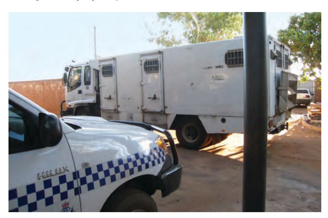
One of the inter-prison vans from the original fleet deployed in 2000 at Halls Creek Lockup.

6.31 It was mentioned above that a pie or sandwich from the freezer is typically supplied to those leaving on escorts, together with a 600 ml bottle of water. This may be a reasonable snack between meals for a short-haul journey up to two hours or so, but is wholly inadequate as a main meal or for a long-haul journey, typically taking between two and a half to six hours. Our fieldwork confirmed that the above provision is standard issue, although a second sandwich or bottle of water is sometimes provided. This issue was highlighted in relation to the Ward incident. It is the Inspectorate's view that a substantial meal should be provided, including a piece of fresh fruit and at least a 1.5 litre bottle of water, to each person embarking on a long-haul transport journey.