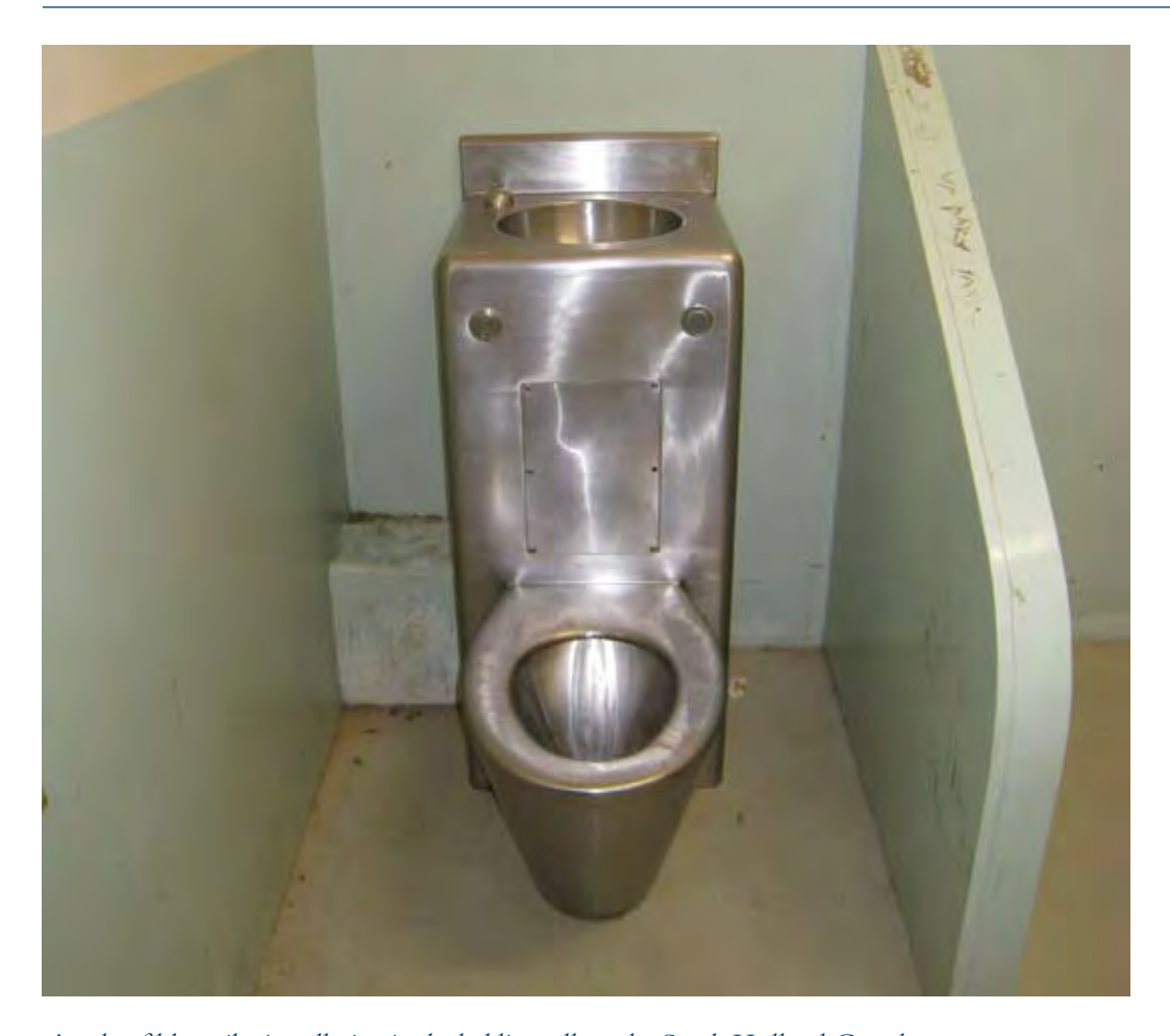
A rather filthy toilet installation in the holding cells at the South Hedland Courthouse. Persons in custody strongly object to having to use water fountains in such installations.