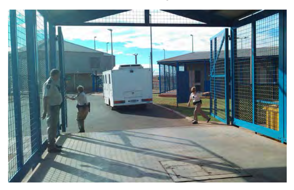
A 'Lima' series prisoner transport leaving the Roebourne Regional Prison sallyport in May 2009. This is one of the safer, more comfortable newly built transports, although it lacked a toilet for the 600km journey to Newman for which it was sometimes used.

3.17 Prisoners who had experienced transport in one of the prototype vehicles were mostly very positive about these vehicles. We found one assigned to transport women from Bandyup each morning to courts and hospitals. We encountered another in Newman, in which prisoners from Roebourne had been conveyed. We also had feedback from prisoners who had experienced the long-haul prototype on the run between Kalgoorlie or Albany and Perth. These prisoners were especially appreciative of the availability of proper toilets, something sorely lacking in the vehicle used in the six-hour run to Newman. Most were also appreciative of the rather more comfortable moulded seats, increased personal space, availability of seat belts, better views and more reliable air-conditioning afforded in these new vehicles. <sup>16</sup>