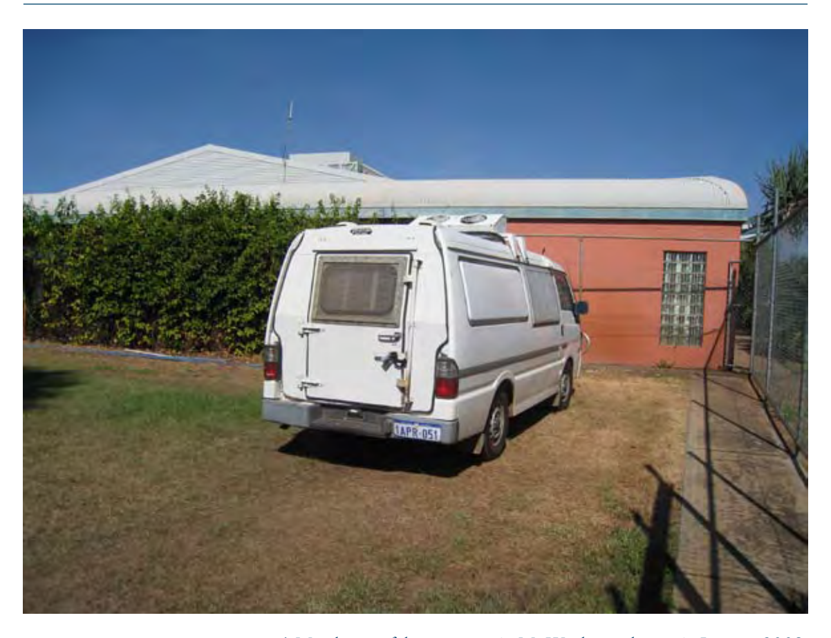
A Mazda van of the same type in Mr Ward passed away in January 2008, still in use at Kununurra in May 2009. This is one of the original fleet deployed in 2000

3.12 In the meantime, evidence was given at the coronial inquiry that in 2001 the Department of Justice had been given a report commissioned by AIMS Corporation from Car Air Wholesale Pty Ltd. This showed clearly that the Mazda van and its air-conditioning system, as configured for prisoner transportation, was never designed to be used in remote locations in conditions of extreme heat. The Inspectorate had never previously been made aware of the existence of such a report. Concluding his analysis about the shortcomings of the Mazda used to convey Mr Ward, the Coroner found that: