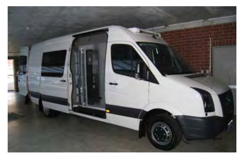
The first of two new custodial transports provided to JCS customised from a Volkswagen Crafter van.

PCC. That aside, the Crafter appeared as fine a cellular-style vehicle for short-haul transports as one might find. All seats are moulded and forward or rear facing and fitted with seatbelts with adequate body space and leg room. There are good views through cell doors and dark tinted windows outside. Good air-flow is available, including when the vehicle is stopped, although air-conditioning is only available when the engine was running.