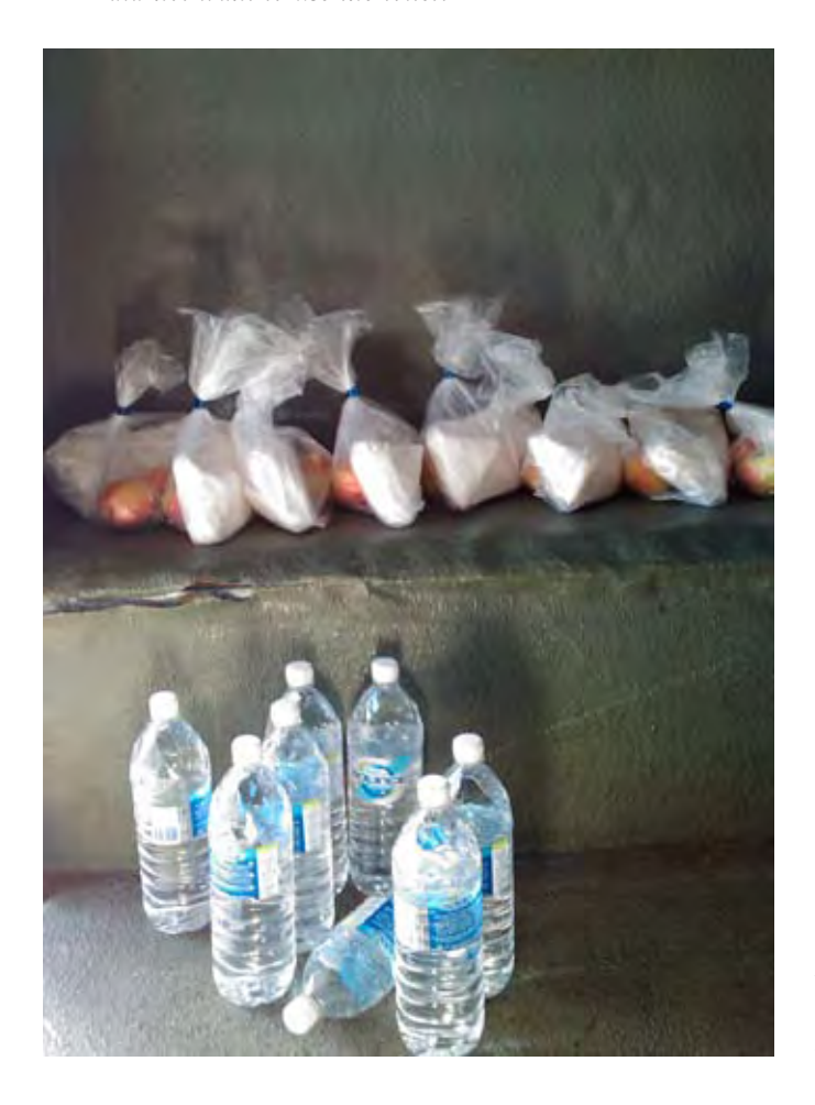
Food waiting on the seat of an inter-prison van at a prison for a long day's journey.

3.44 Seven passengers also claimed not to have eaten on the journey. Most of these declined to eat food supplied, because they found it inedible, had problems with nausea while travelling in such conditions or did not want to have to use the in-cell potty in the inter-prison transports, one claimed not have been supplied water in their cell: