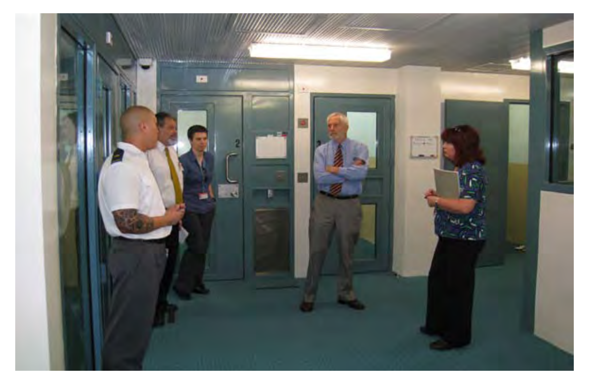
Inspectors with the G4S Supervisor at the Secure Facility at the Royal Perth Hospital Outpatients Clinic.

3.49 Despite the negative comments about driving, it should not be forgotten that prisoners were relatively happy with G4S staff for these escorts. There was a tendency however, to see metro-based crews more negatively, as they were considered less flexible than certain regionally-based crews. Inspectors observed an instance of this at a roadhouse, where the escort encountered the family of a minimum-security prisoner on board. The crew opened the outer security door to allow the prisoner to communicate with his family for a time before proceeding.