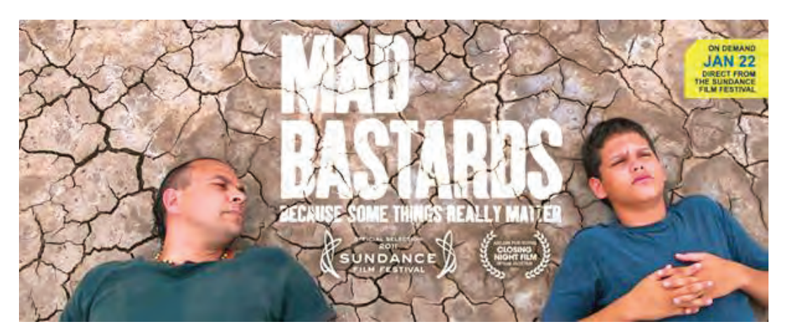
Photo 8: The film Mad Bastards was used in a program presented by Mibbinbah at Wandoo in 2013

5.17 Wandoo is intending to train one of its program staff to facilitate this course which it considers a good fit with its restorative justice focus. Alternatively, as discussed above at [5.4], it may be incorporated into future Pathways programs at Wandoo and possibly elsewhere.