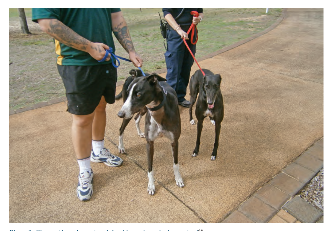
Photo 9: Two residents have since left with greyhounds they trained<sup>66</sup>