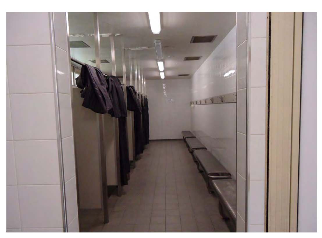
Figure 8: The newly refurbished bathrooms in Units 2 and 3 were of a high standard.