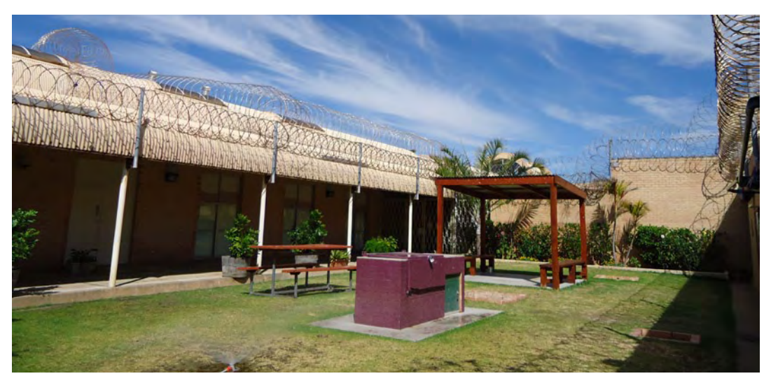
Figure 11: The outdoor area of unit 5