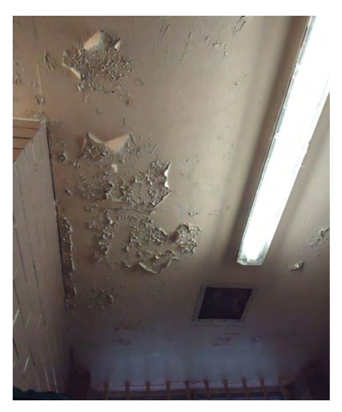
Figure 9: In contrast, the bathroom facilities in Unit 1 were in poor condition.