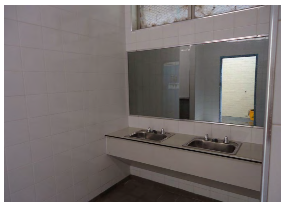
Figure 7: The newly refurbished bathrooms in Units 2 and 3 were of a high standard.