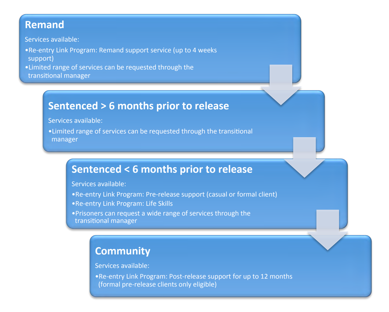
Figure 1 Overview of re-entry services available to prisoners