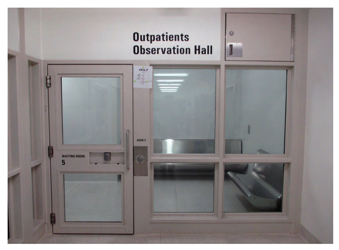
Figure 8: The new secure facility at Fiona Stanley Hospital

6.8 There were two control rooms next door to each other to manage the secure facility. Each was identical to the other, but one looked into the inpatient facility and the other into the outpatient facility. If the inpatients facility was ever used, the inpatients control room would need to operate 24 hours a day – it was presently functioning as an office for the unit manager.