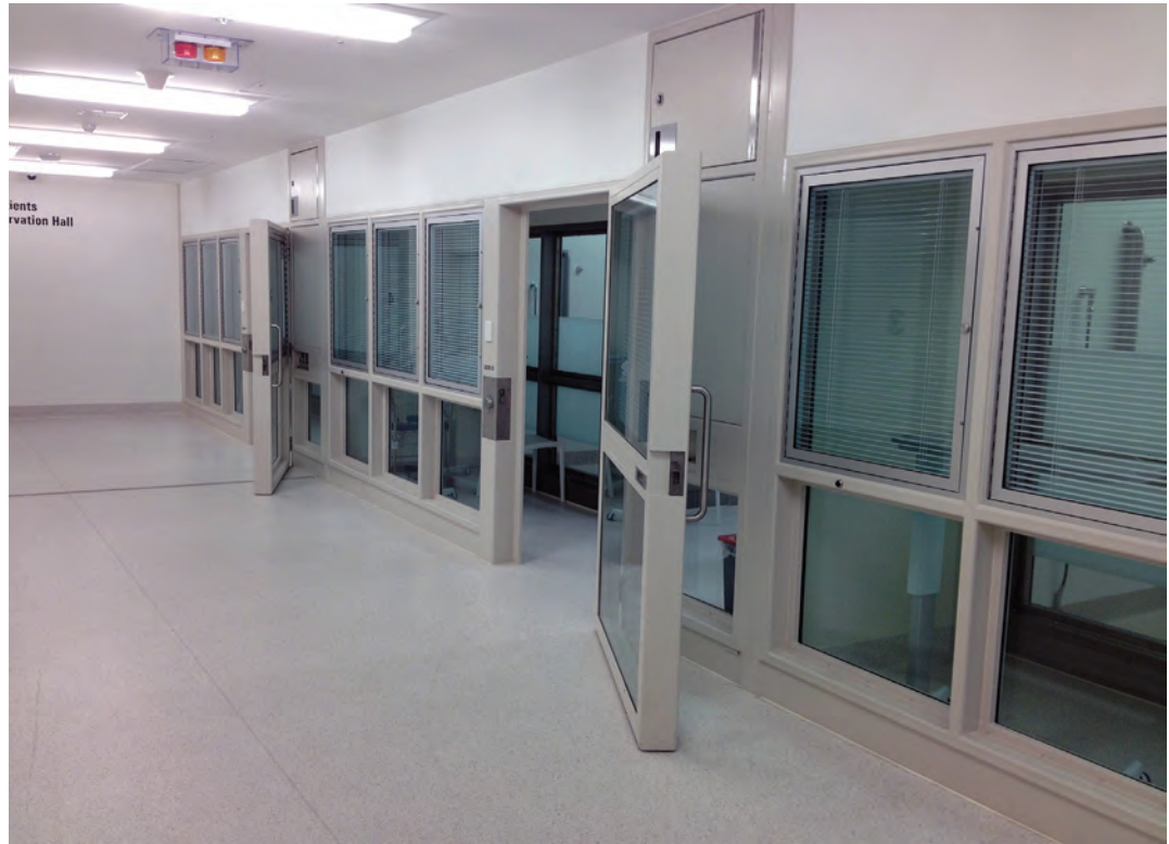
Figures 6 and 7: The new secure facility at Fiona Stanley Hospital