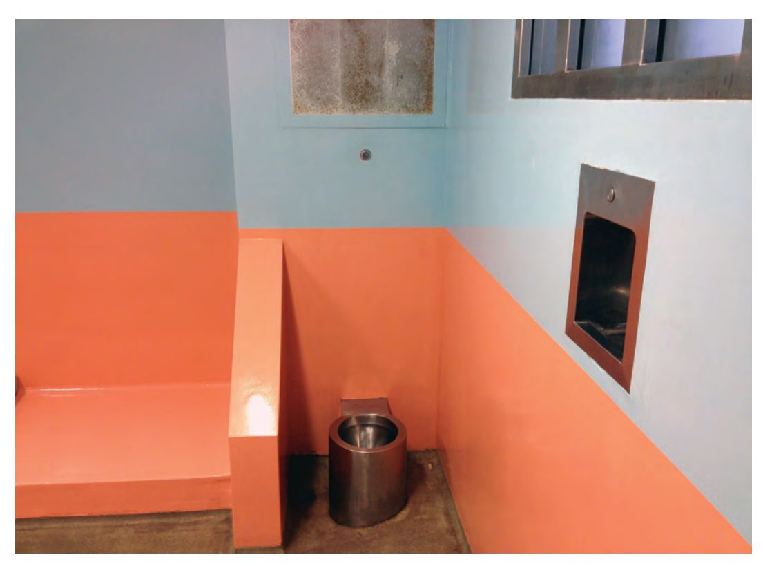
Figure 4: A cell in the court custody centre at Geraldton