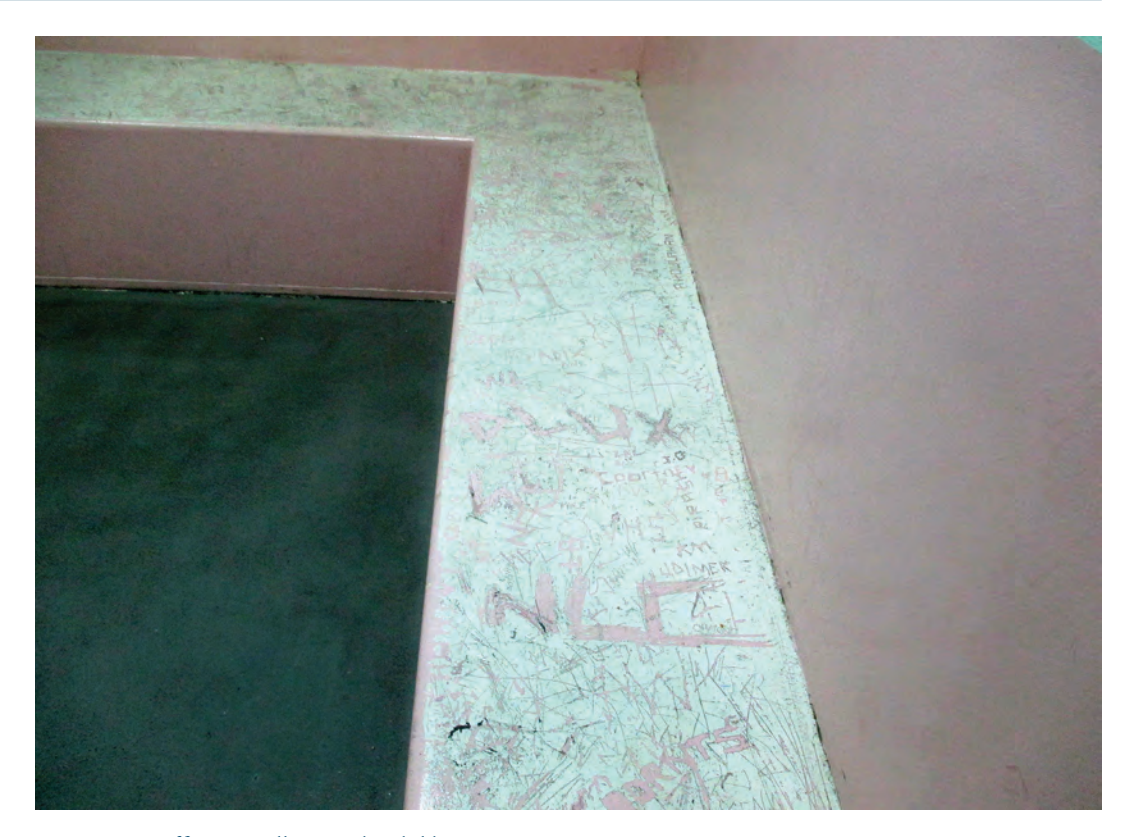
Figure 3: Graffiti in a cell at Perth Children's Court

3.22 The previous inspection report raised concerns about the management of adults in custody at Perth Children's Court. Adults who are accused of committing a crime before they reached the age of 18 can still have their case heard in children's court. In some cases, decades may have passed since the offence was committed, meaning that the custody centre is required to manage a middle-aged person alongside juveniles. Obviously, adults and juveniles in custody must be strictly segregated, and this placed extra pressure on the centre. The inspection report recommended that 'the courts should examine alternative processes for adults to appear at other courts specifically designed to hold adults in custody' (OICS 2013, 10, Recommendation 3). DotAG responded that it was for the court to determine the appropriate way to deal with such cases. In 2015–2016, there had been no change and adults continued to appear at Perth Children's Court and spent time in the custody centre on a regular basis.