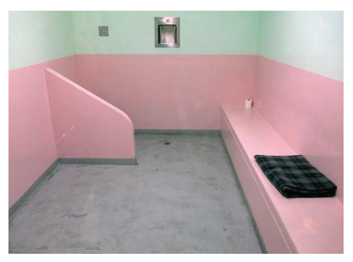
Figure 1: A cell in the court custody centre at Armadale

The Department of Corrective Services should ensure that prisons provide timely confirmation of authority to release.