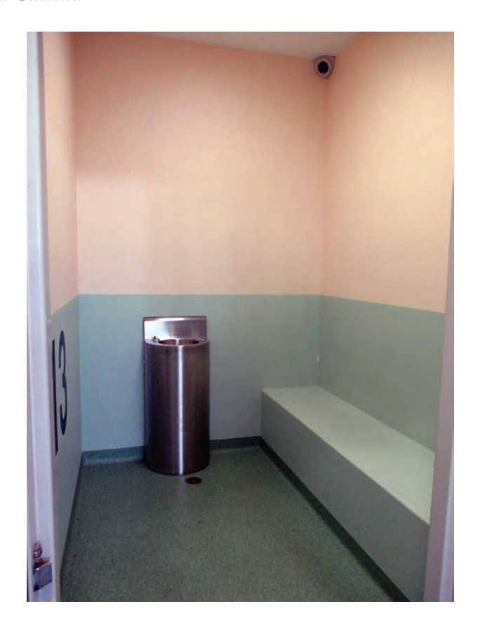
Figure 5: A cell in the court custody centre at Kalgoorlie