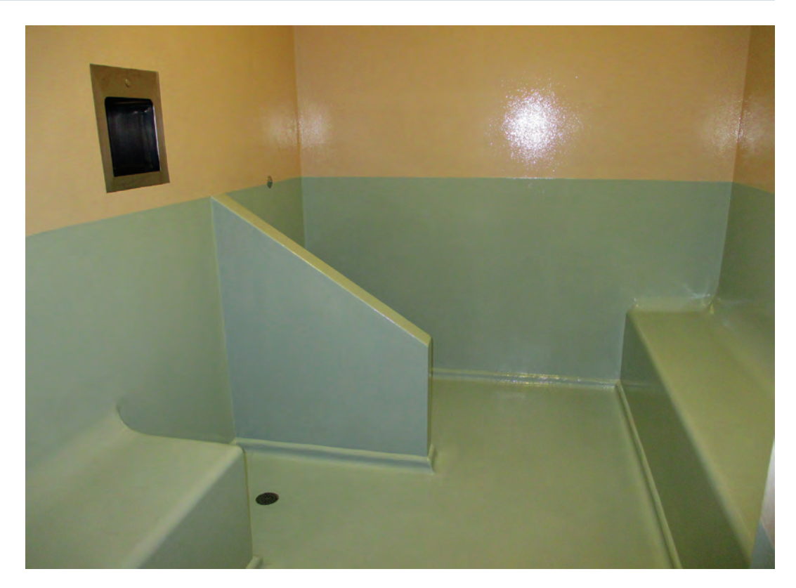
Figure 2: A cell in the court custody centre at Fremantle