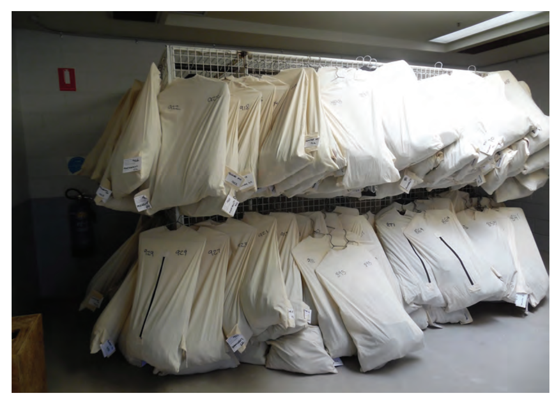
Figure 3: Civilian clothing bags hanging on top of each other