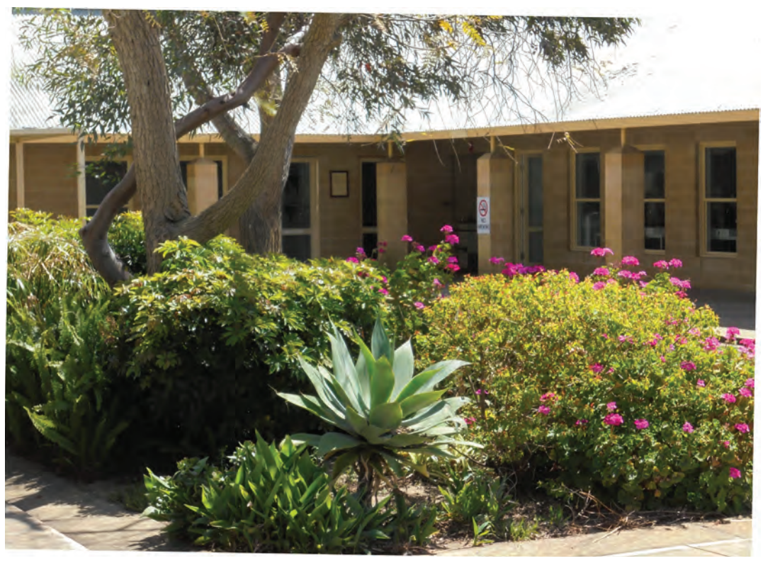
Figure 11: Gardens in the Education Centre at Casuarina Prison

Increase the capacity of the Education Centre, the number of traineeships, and the use of existing facilities.