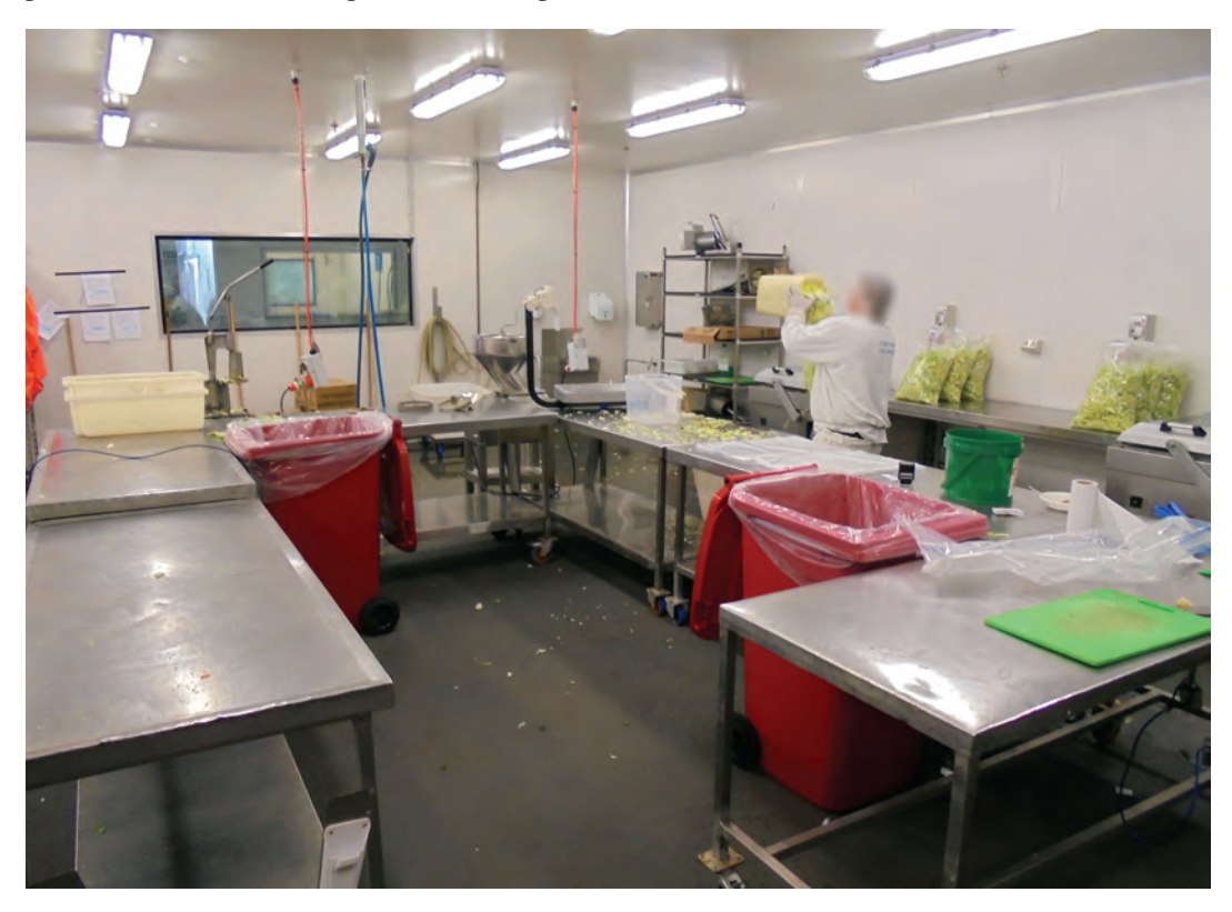
Figure 8: Work in the vegetable preparation area at Casuarina Prison

Casuarina obtains and packs vegetables for other prisons, mainly peeling and chopping and placing in vacuum sealed bags. It appeared to operate safely and effectively with careful attention to cleaning, maintenance and safe food handling. However, cobwebs and grime were accumulating on the ceiling.