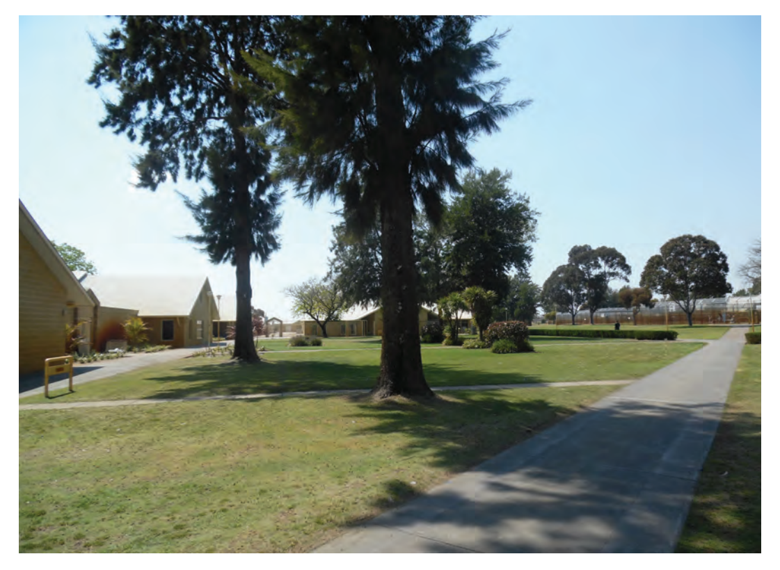
Figure 13: Open spaces and gardens are an important feature

In short, there are too many prisoners for the available facilities. This carries inherent risks to security and to the safety of staff and prisoners (OICS, 2016).