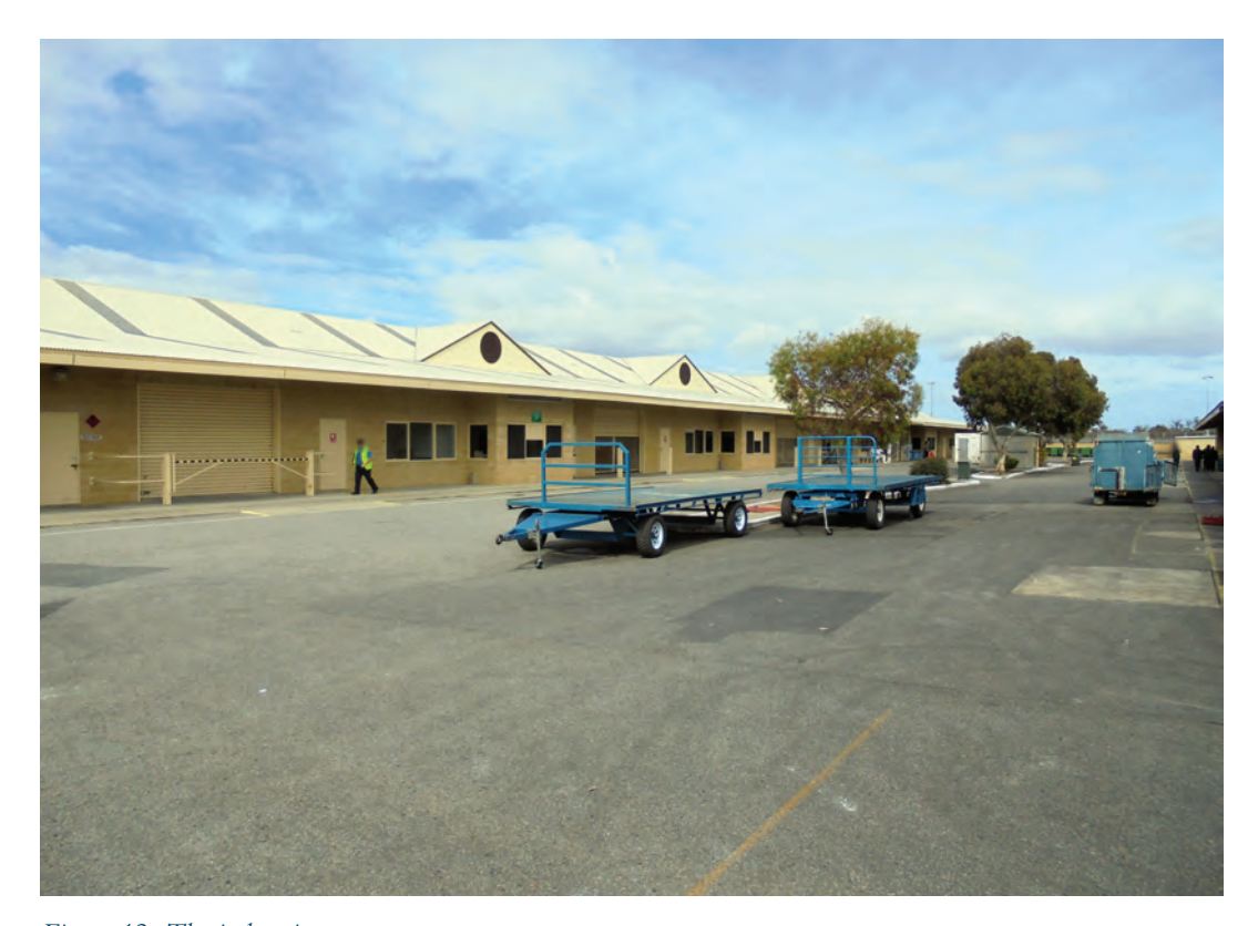
Figure 12: The industries area

The problems have not been addressed. In fact they have become worse as the Department has tried to manage reducing budgets and the population has increased.