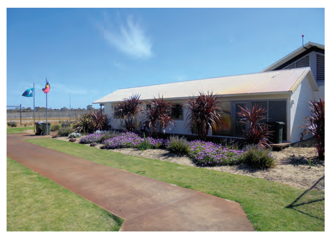
Figure 7: The Learning Centre at Casuarina Prison

At times of crowding, prisons need to use every facility they have. We could see no justification for the fact that several demountable classrooms at the western end of the Learning Centre were unused or under-used. Discussions were underway as to the future use of these rooms. We hope that this will maximise the cultural and educational benefits to Aboriginal prisoners.