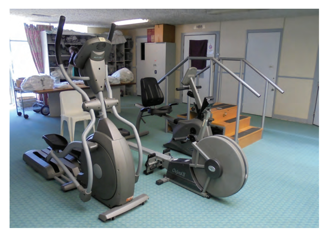
Figure 5: Exercise equipment for rehabilitation in the infirmary

Evaluate current and future demand for specialist infirmary services across the prison system and invest as necessary in Casuarina and other prisons.