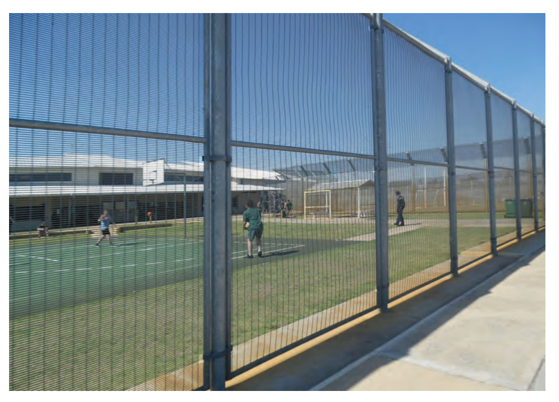
Figure 6: Prisoners recreating in the exercise yard in Unit 14

Casuarina is a crowded prison environment where recreation is a vital 'safety valve'. Over the past six months the recreation team has proved what it can achieve without extra resources. It makes sense for the Department to capitalise on the proven strengths of the recreation team and to expand the program further.