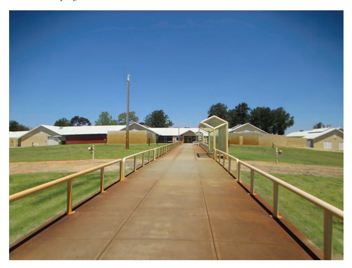
Figure 1: The entry path to Casuarina Prison, leading to the administration building and visits centre

Casuarina Prison opened in 1991 to replace Fremantle Prison. Casuarina's original design capacity was for 397 prisoners. At that time it was considered a large prison, primarily intended for sentenced prisoners to undertake industrial employment, related training and rehabilitative programs.