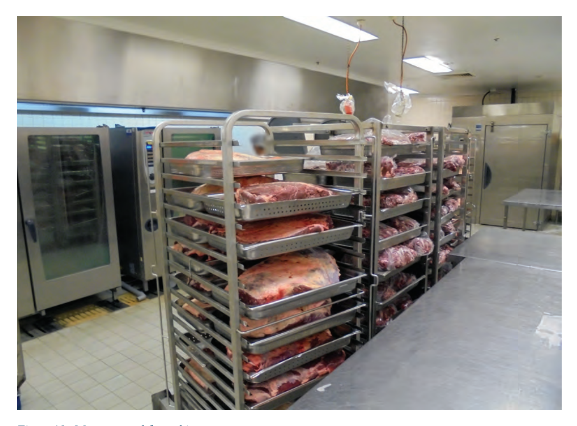
Figure 10: Meat prepared for cooking