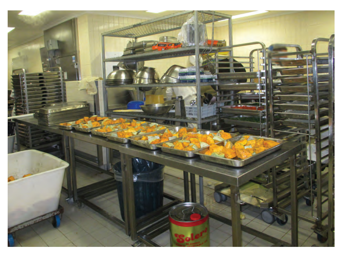
Figure 9: Vegetables prepared for cooking