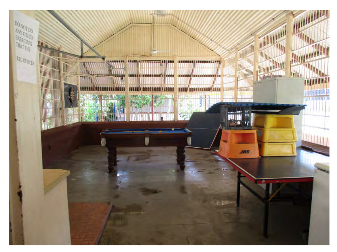
Figure 5: The old 'Bull Pen', the only remaining structure from the original prison

assessed for any health conditions. The mattresses would almost certainly contain dust mites, dead skin cells, bed bugs, mould, and other bacteria and fungi that could lead to asthma, skin diseases, allergies, and infections.