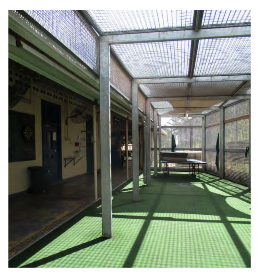
Figure 1: The outdoor patio area of the maximum-security unit

room was restricted. Each afternoon it was used as a visits room and was regularly used for counsellors and other staff to meet privately with prisoners. Most prisoners ate their meals in their cells.