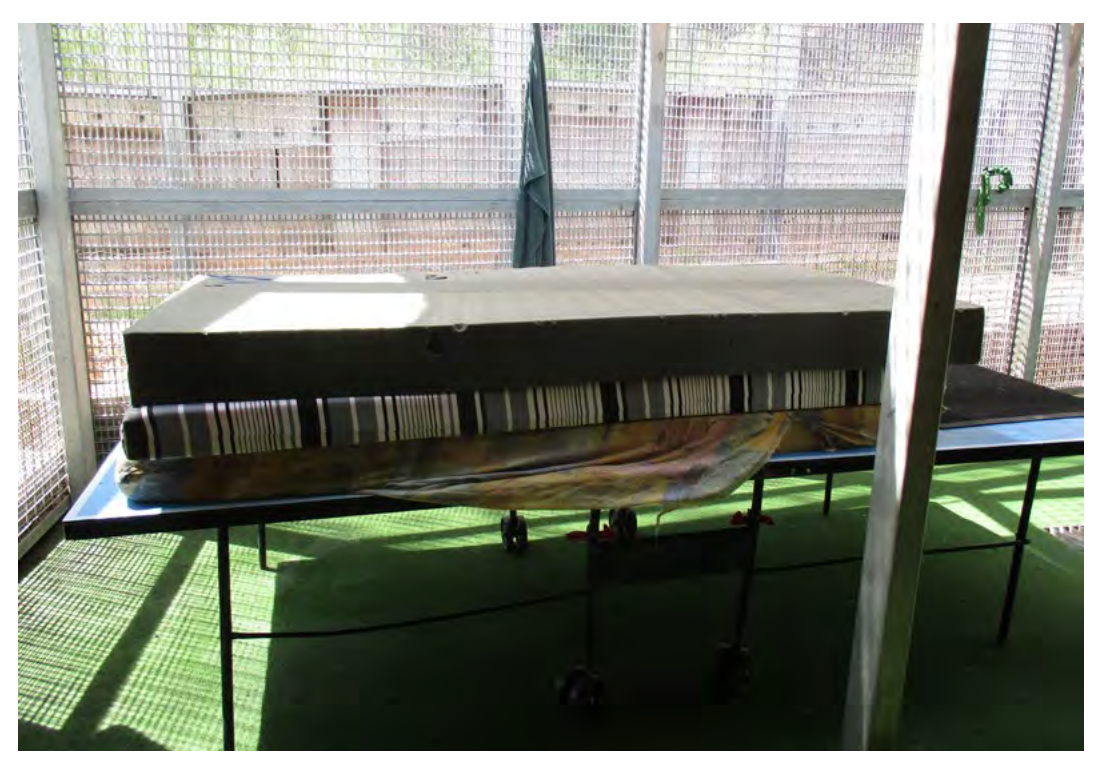
Figure 6: Spare mattresses stored on the table tennis table in the maximum-security unit