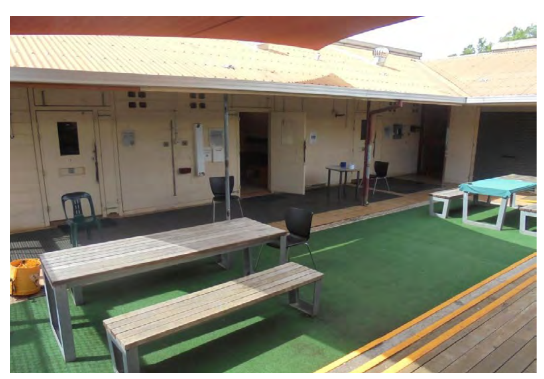
Figure 9: The small courtyard in the women's unit

Women were not meant to stay at Broome for long periods of time. The unit regime was intended for women to stay short-term to attend local funerals, for family/children visits, for medical appointments, or for court. The Department justified their lack of services for women by the fact that they were only accommodated for short periods of time. However, during the inspection there were five women in the unit, and some had been there for a long time. One woman had been at Broome for more than six months.