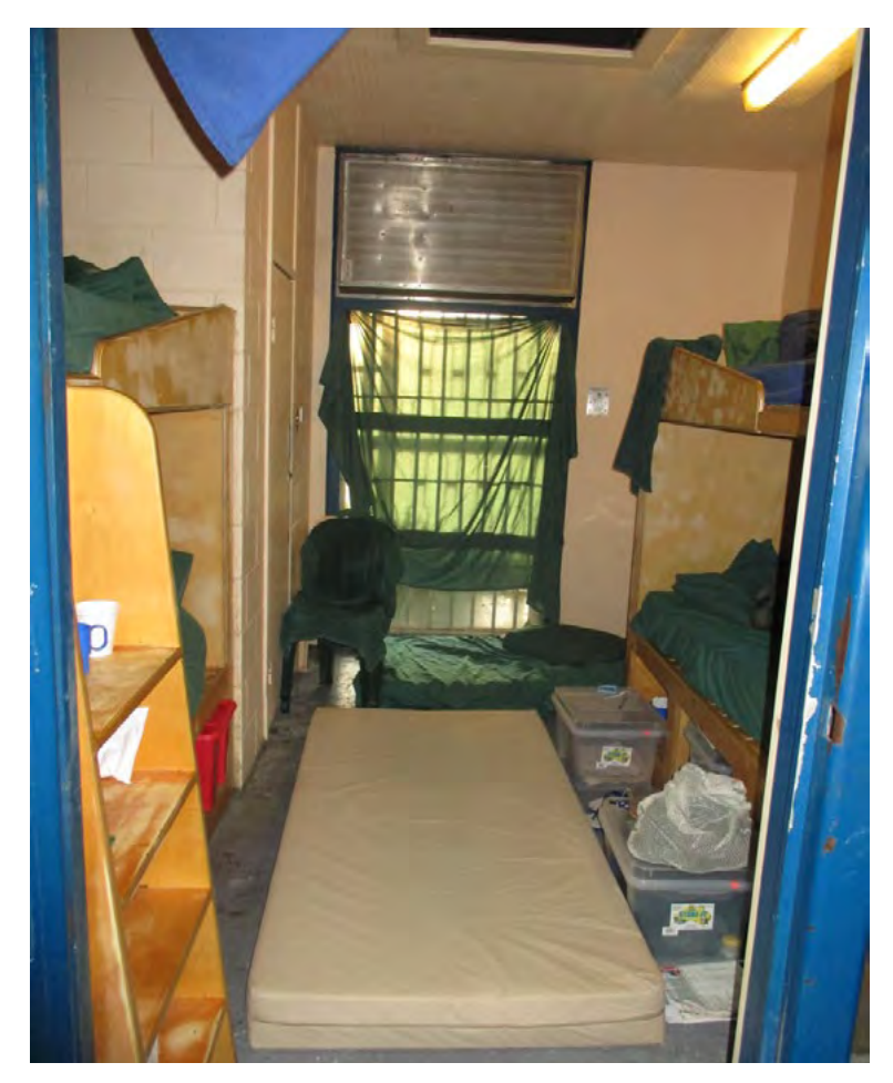
Figure 4: A crowded cell sleeping six prisoners in the maximum-security unit

It was built in 1894 as an open shelter, and in 1907 bars were installed so it could be used as a holding pen for Aboriginal prisoners. In the early 20th century, Kimberley law enforcement protected land owners and their livestock from the Aboriginal people, and Aboriginal people in custody were routinely treated violently by police. The bull pen contains painful memories for Aboriginal men and women, and it would be culturally insensitive and inappropriate to keep people there overnight. We were relieved to see that, on the Thursday night of our inspection, it had proved unnecessary for prisoners to be placed there.