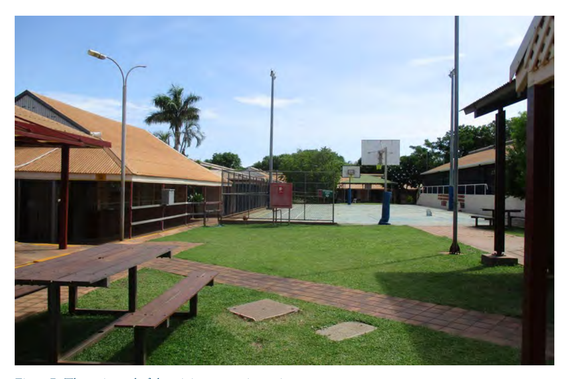
Figure 7: The main yard of the minimum-security section