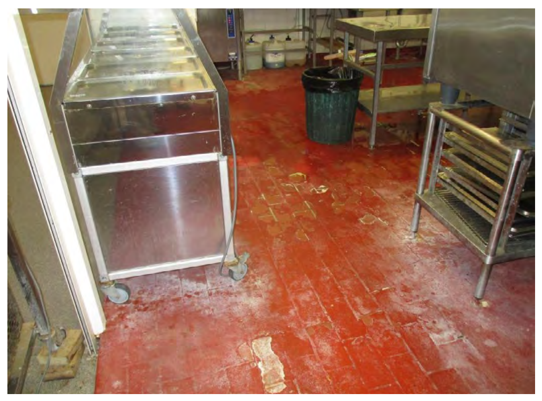
Figure 8: The damaged and dangerous kitchen floor