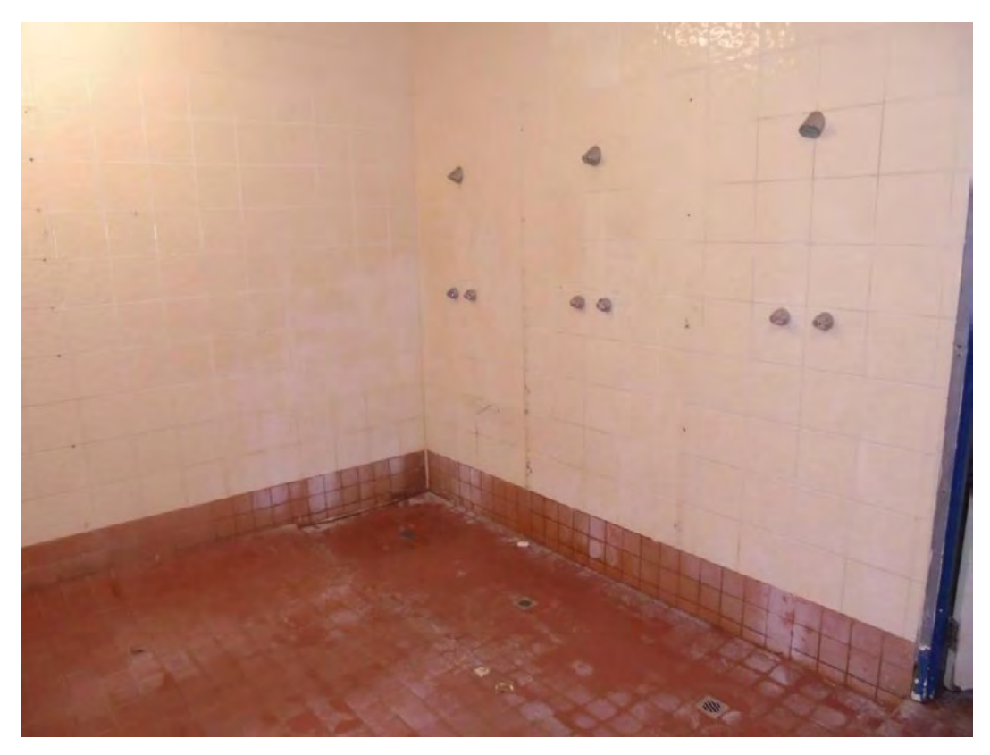
Figure 3: The communal showers in the maximum-security unit