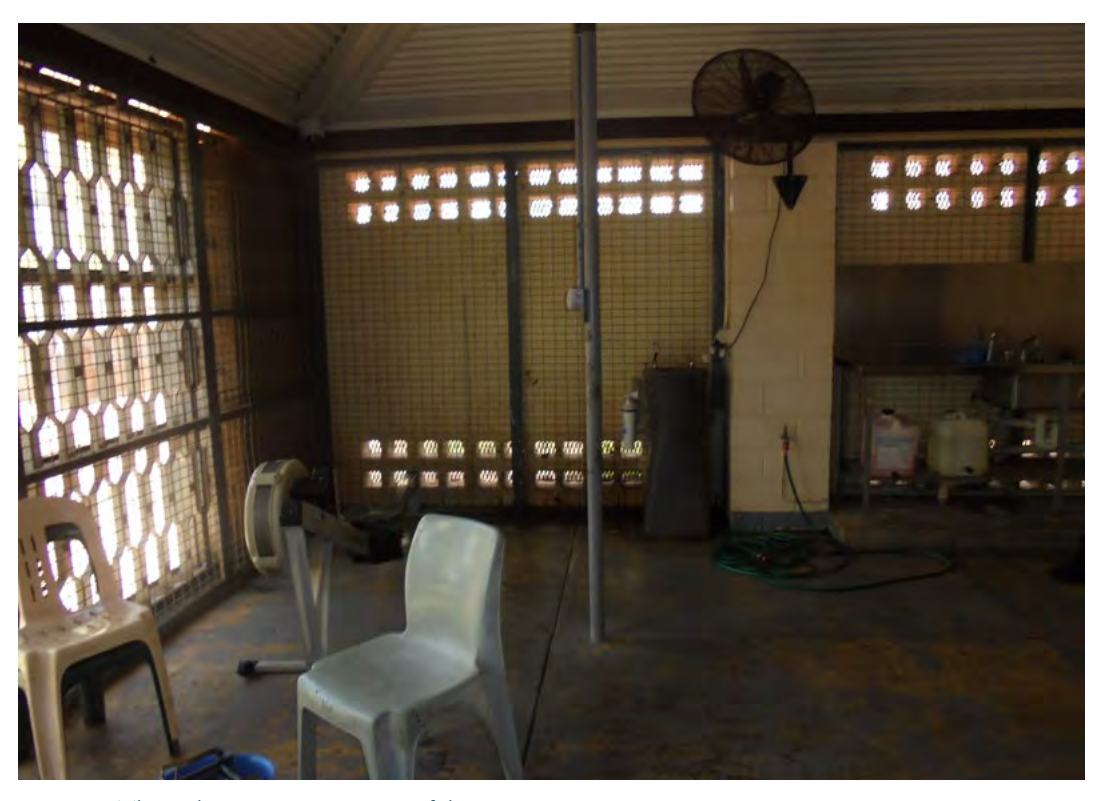
Figure 2: The undercover recreation area of the maximum-security unit

There was nowhere for the prisoners to retreat to for quiet or alone time. They were constantly in each other's space and the frustration at times was causing tension in the unit. As there was little to do in the yard, and limited space, prisoners spent most of their time in their cells, lying idly on their beds.