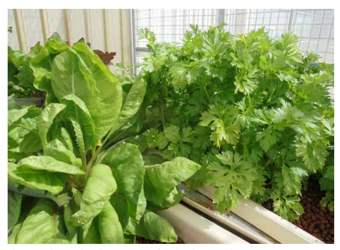
Photo 2: Bunbury produces large quantities of good quality vegetables.