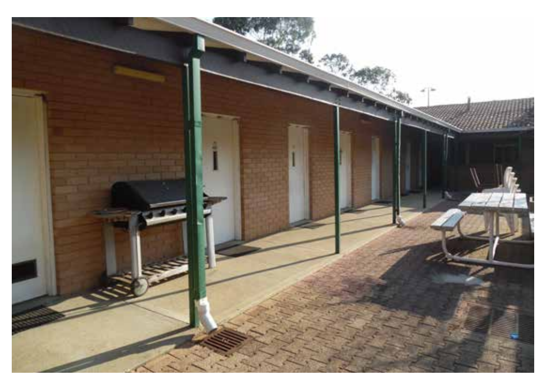
Photos 4, 5: Unit 5 will need some refurbishment before it re-opens.