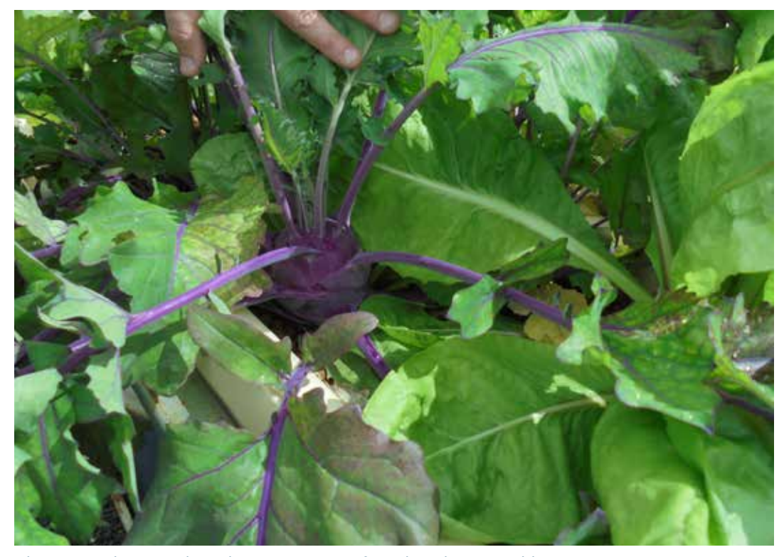
Photo 1: Bunbury produces large quantities of good quality vegetables.

Bunbury Regional Prison (Bunbury or BRP) is a mixed classification facility, receiving maximum, medium and minimum-security prisoners, including both remand and sentenced prisoners. It has a significant responsibility in preparing prisoners for release, and is a major producer of vegetables for the prison estate. The industries at the prison manufacture bunk beds for other prisons and the metal shop manages various external contracts. It has also been called a programs prison, and is one of the most active facilities when it comes to delivering rehabilitative programs to prisoners.