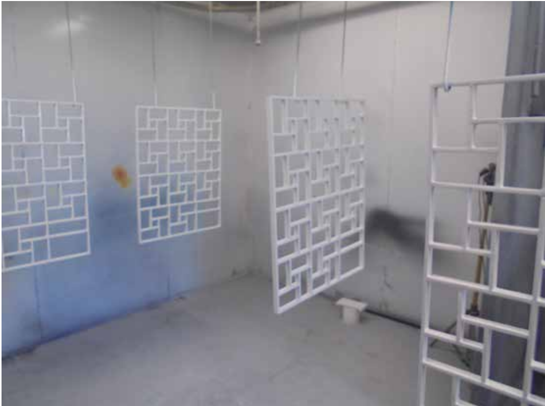
Photos 9 and 10: Productive industries and well-equipped workshops.