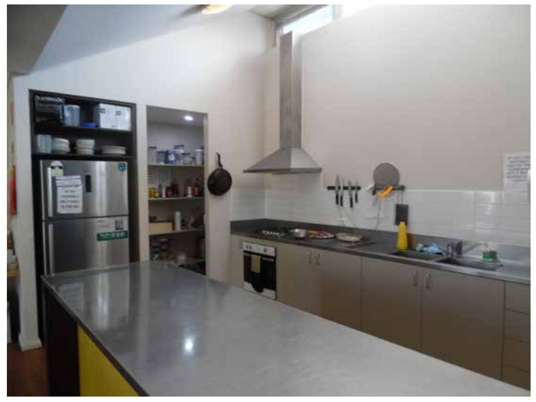
Photo 15: Cooking facilities were not designed to cater for a dozen men.