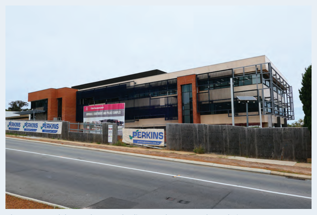
Photo 12: Armadale Courthouse and Police Complex: expected completion 2023